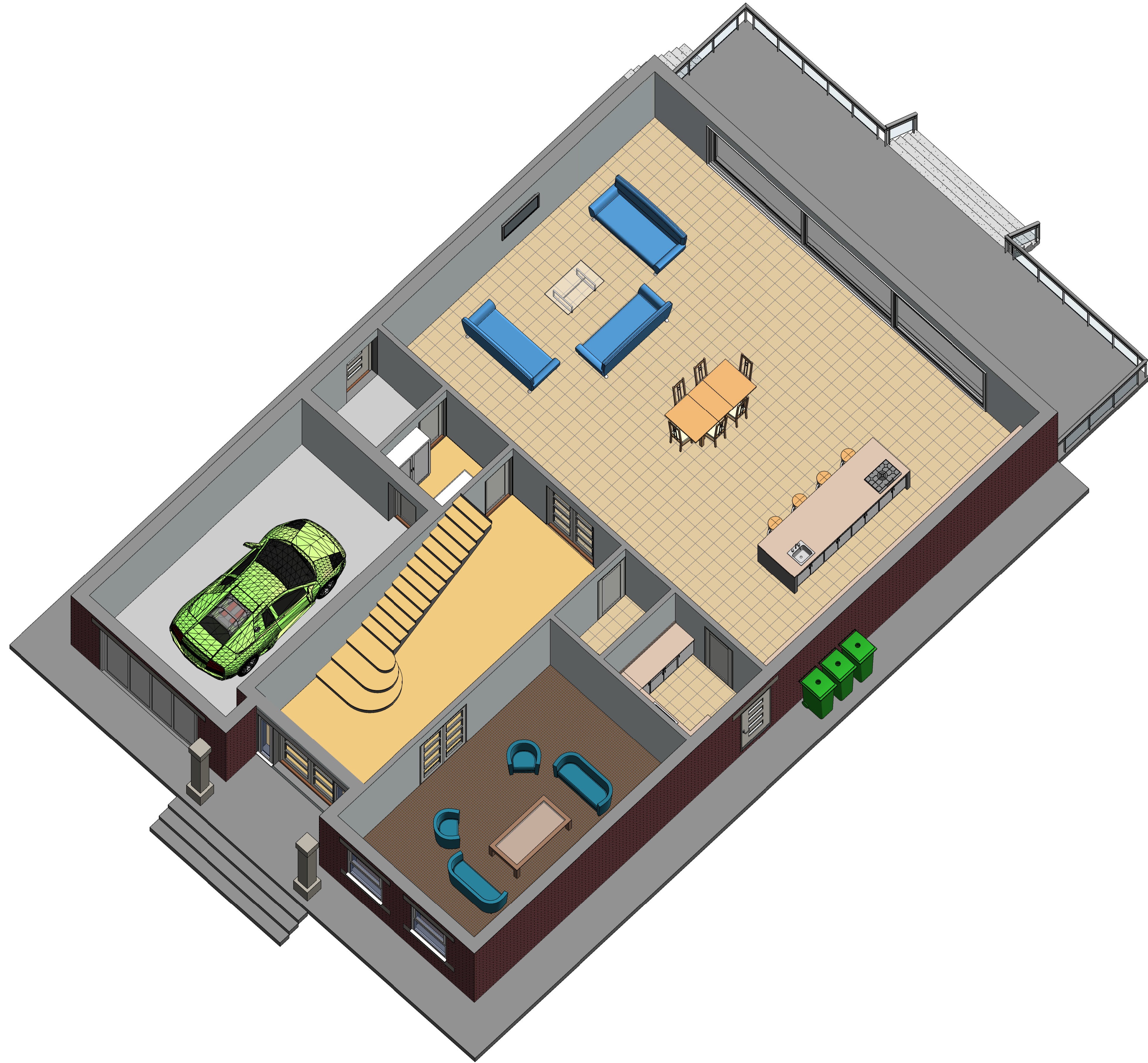
1 Proposed Ground Floor 3D

Contractor to check all dimensions, drain runs and general conditions on site before commencing work. Any discrepancies to be notified to ADI before continuing work. All works to be carried out in accordance with Building Regulations, British Standards, Code of Practice, CDM Regulations and Local Authority requirements. The building owner must obtain formal agreement under the Party Wall Act 1996.