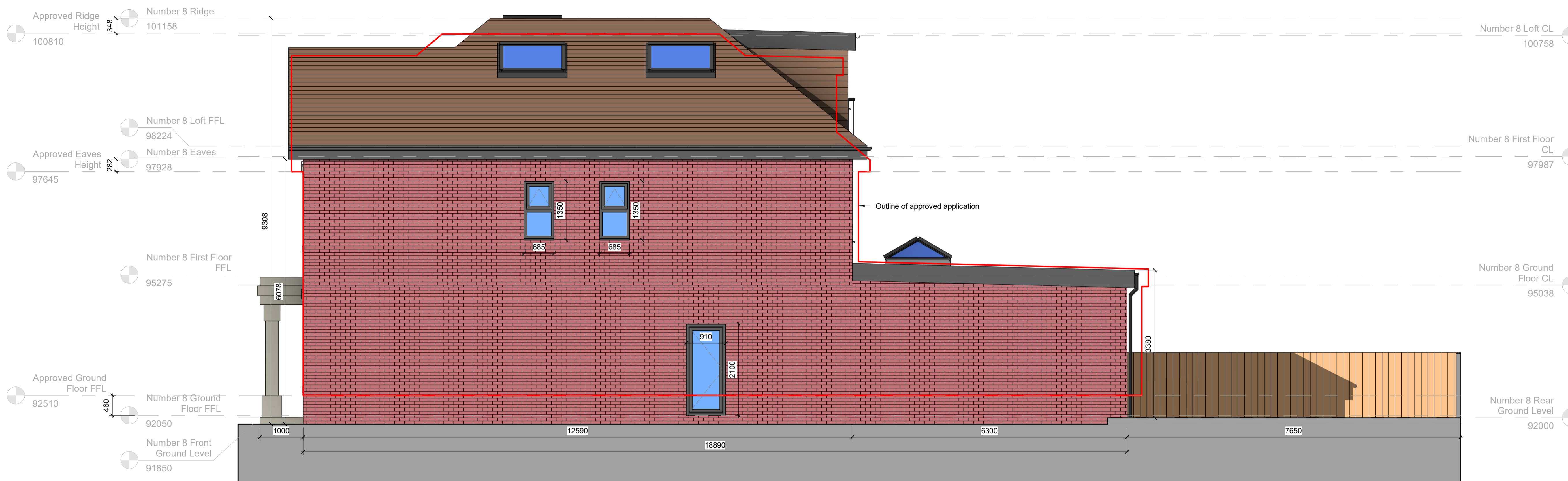
1 Right Side Elevation 1 : 50