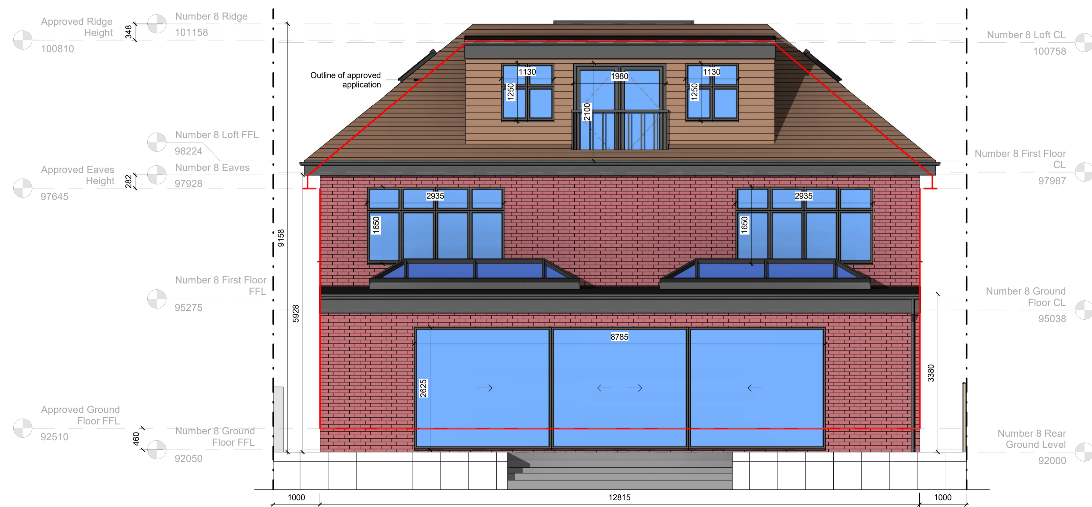
2 Rear Elevation 1 : 50