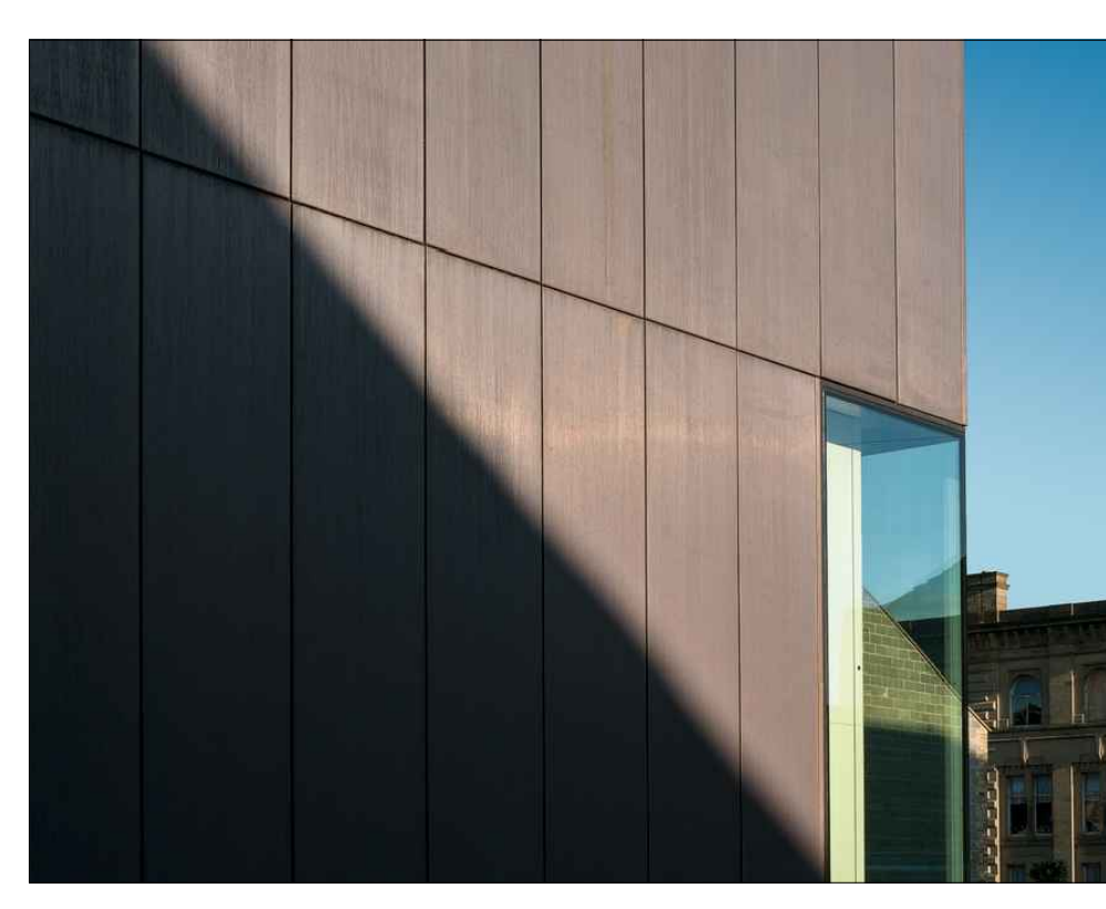
EXAMPLES OF BRONZE CLADDING