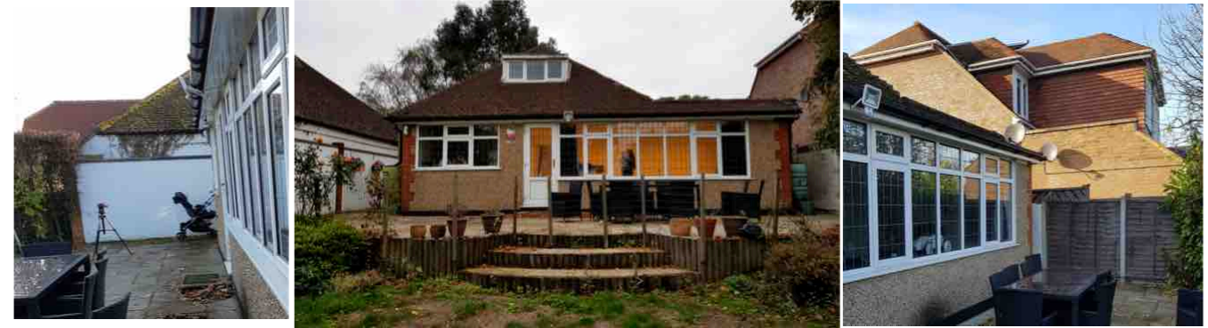
EXITING REAR ELEVATION