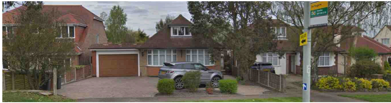
EXITING FRONT ELEVATION