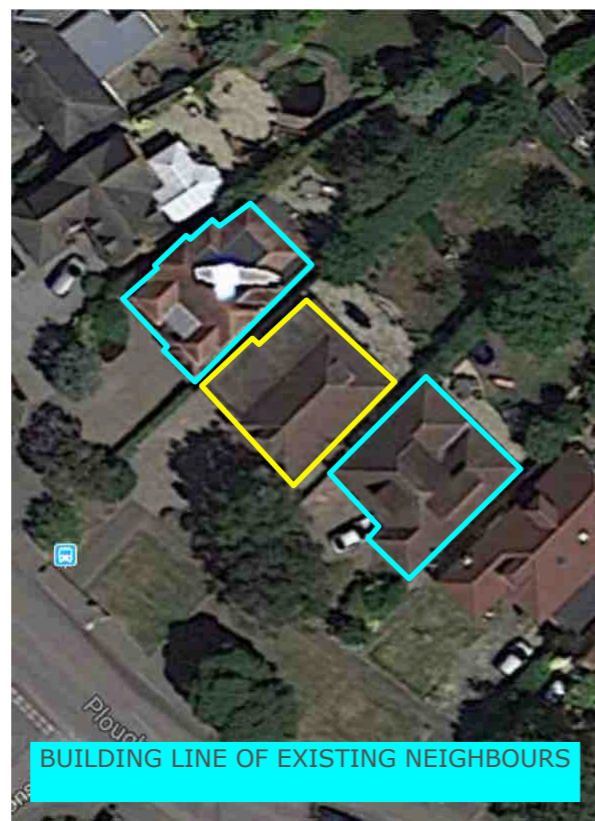
BUILDING LINE OF EXISTING NEIGHBOURS

Site Plan shows area bounded by: 530182.24, 202995.26 530323.66, 203136.68 (at a scale of 1:1250), OSGridRef: TL3025 306. The representation of a road, track or path is no evidence of a right of way. The representation of features as lines is no evidence of a property boundary. Produced on 19th Dec 2018 from the Ordnance Survey National Geographic Database and incorporating surveyed revision available at this date. Reproduction in whole or part is prohibited without the prior permission of Ordnance Survey. © Crown copyright 2018. Supplied by www.buyaplan.co.uk a licensed Ordnance Survey partner (100053143). Unique plan reference: #00379271-E45F3A Ordnance Survey and the OS Symbol are registered trademarks of Ordnance Survey, the national mapping agency of Great Britain. Buy A Plan logo, pdf design and the www.buyaplan.co.uk website are Copyright © Pass Inc Ltd 2018