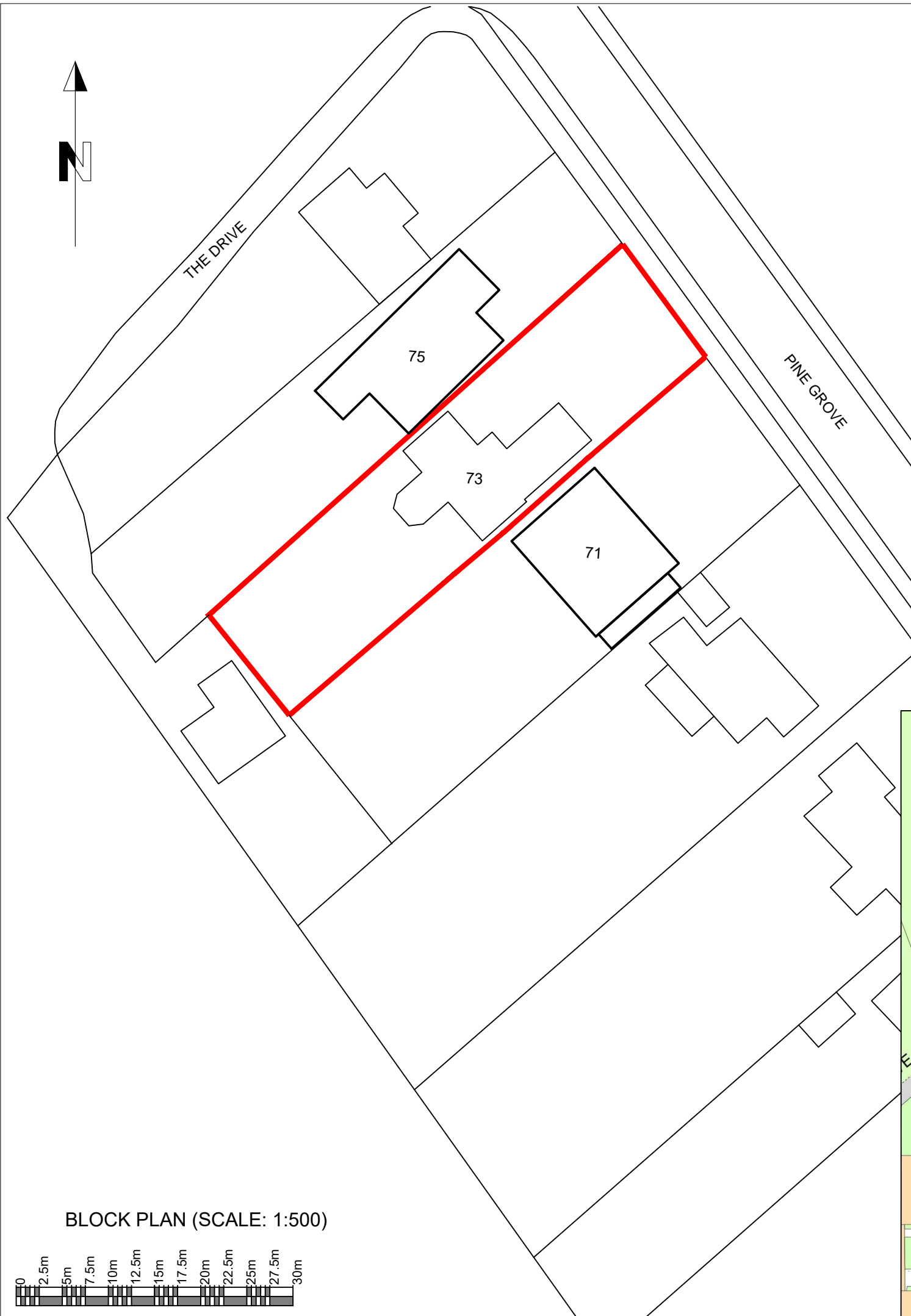
BLOCK PLAN (SCALE: 1:500)