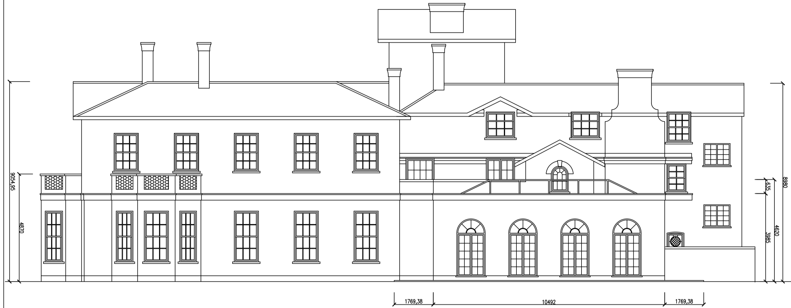
GRANTED NORTH ELEVATION