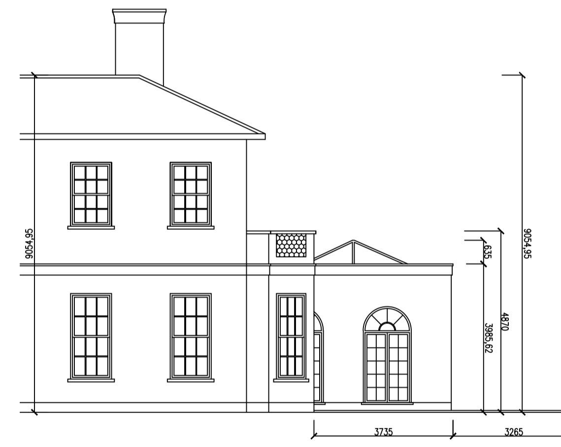
GRANTED EAST ELEVATION