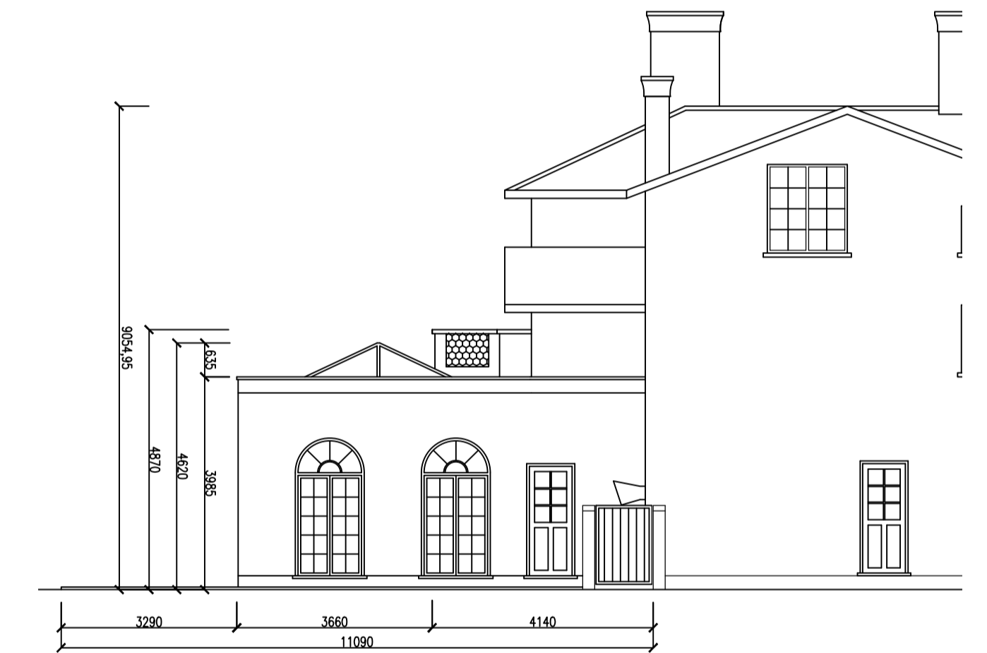
GRANTED WEST ELEVATION