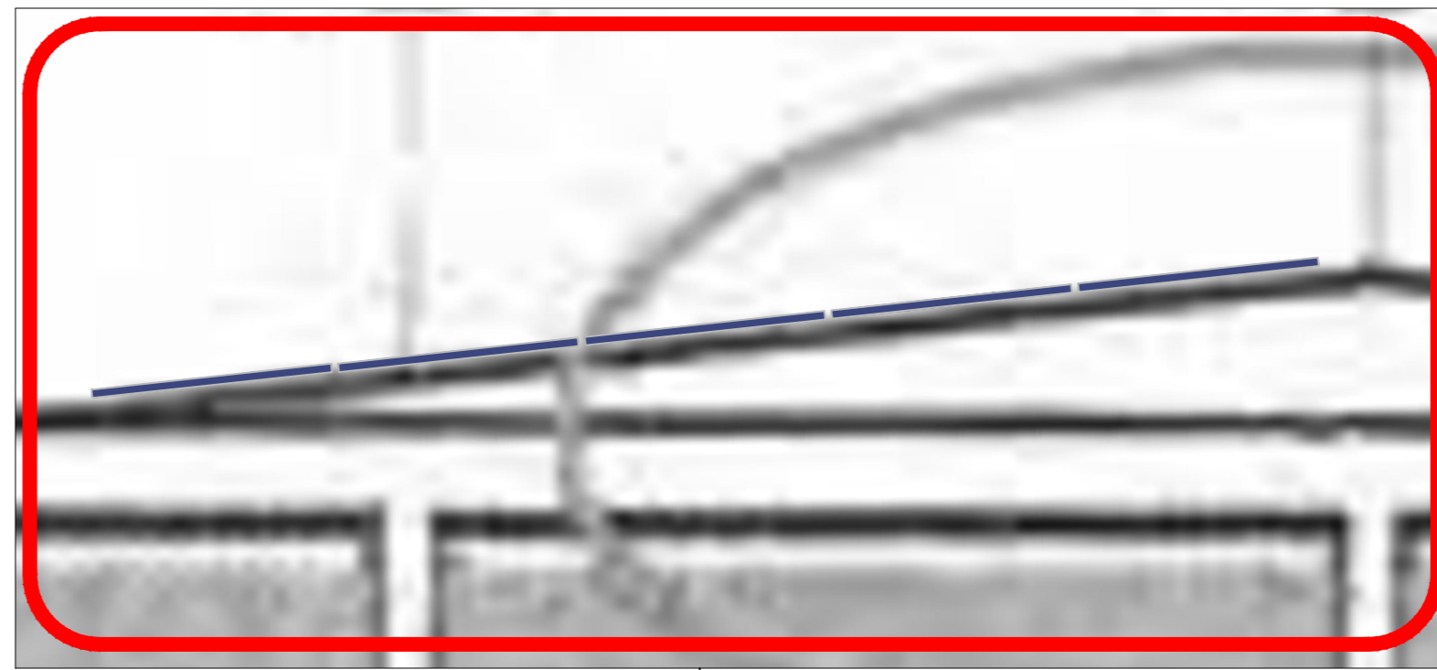
DETAIL 2 - 1:50

FOR CONTINUATION, SEE DRAWING 634-SYZ-EL-02G