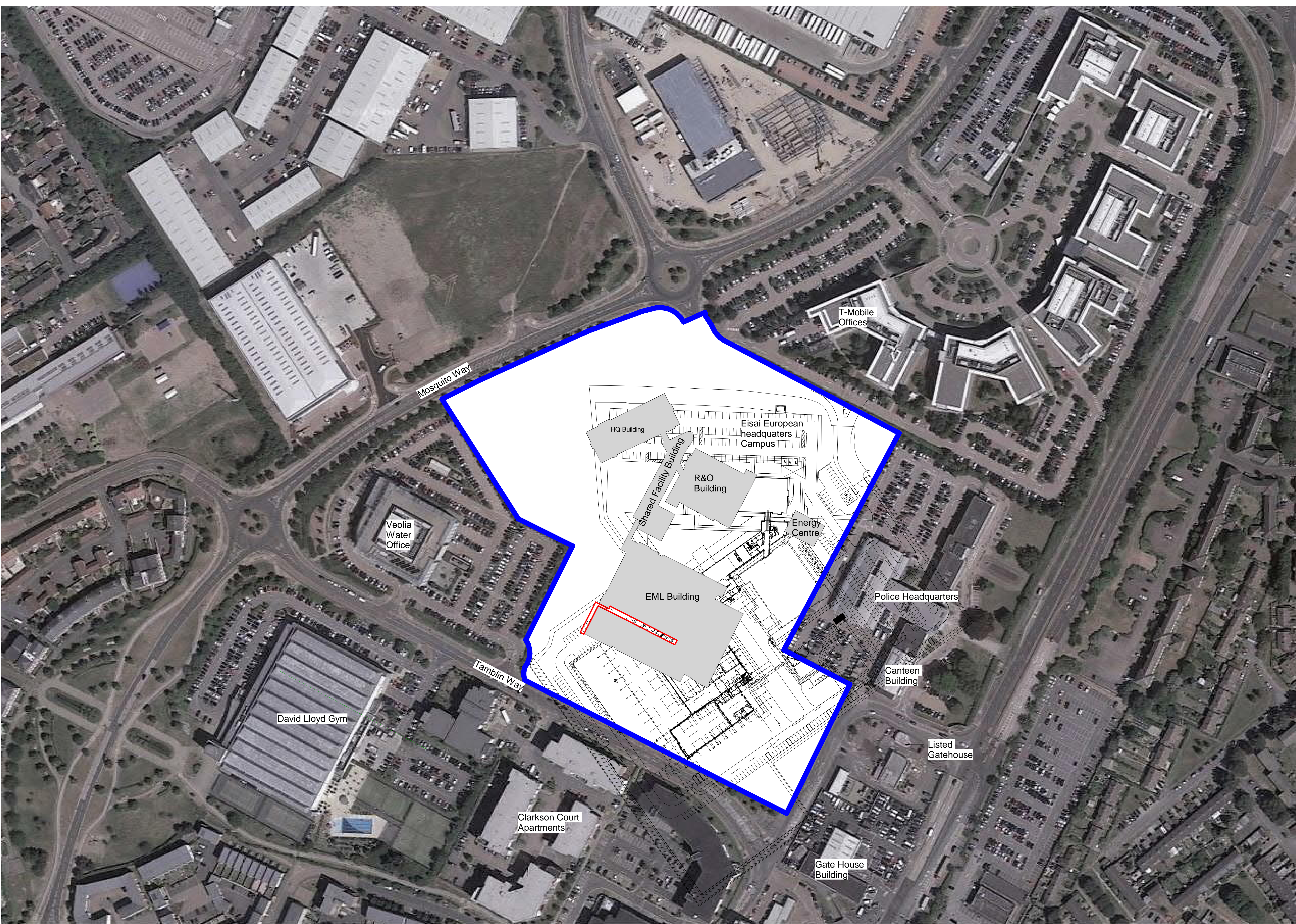
Location Plan SCALE: 1:1250