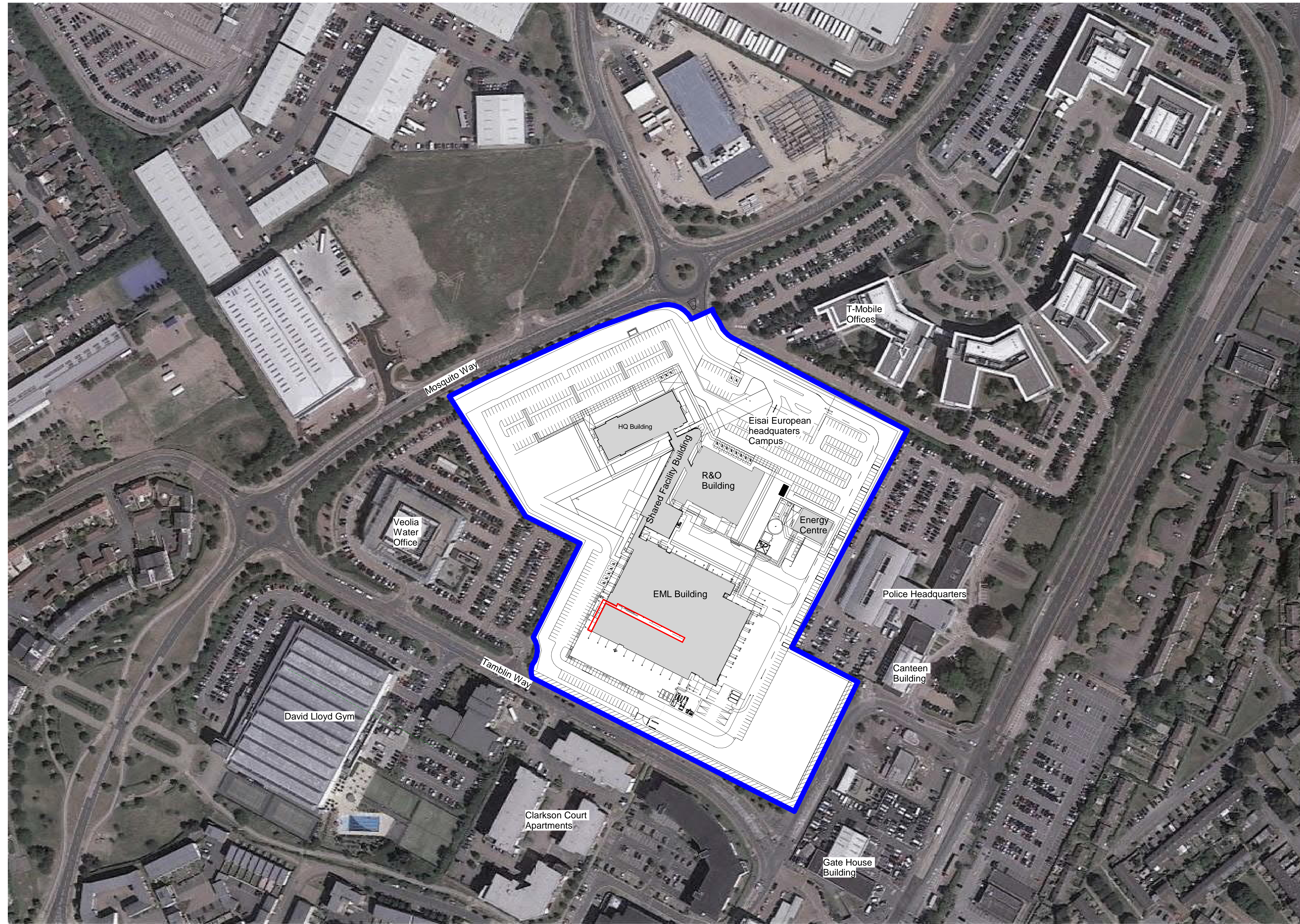
Location Plan SCALE: 1: 1250