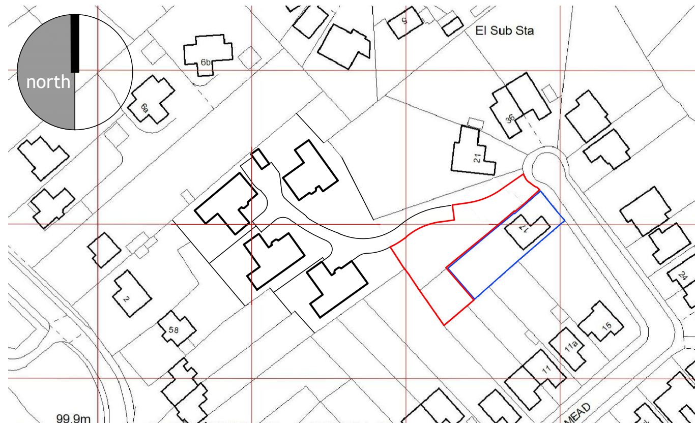
SITE LOCATION Site area = 763m 2