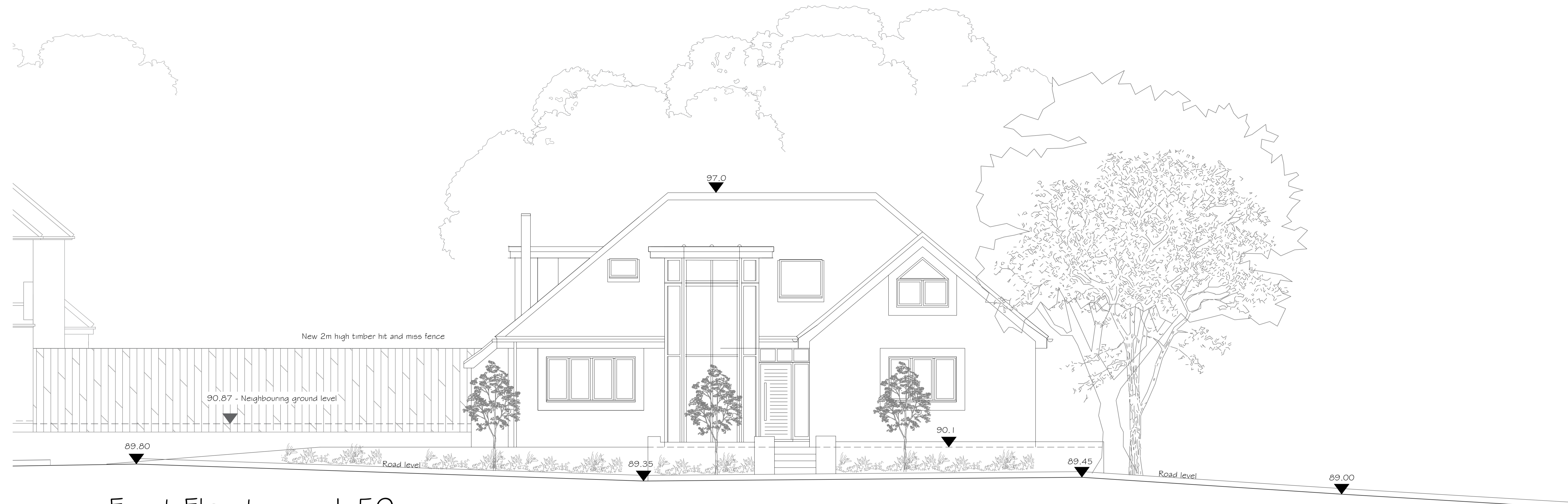
Front Elevation 1:50