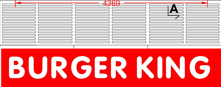
Side Elevation Scale 1:50