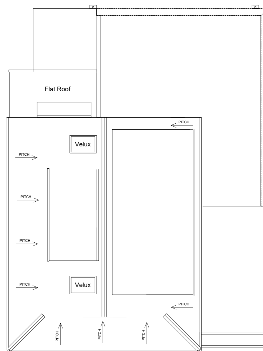
EXT ROOF PLAN