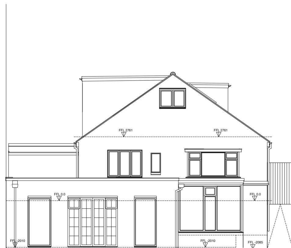
EXT REAR ELEVATION PLAN