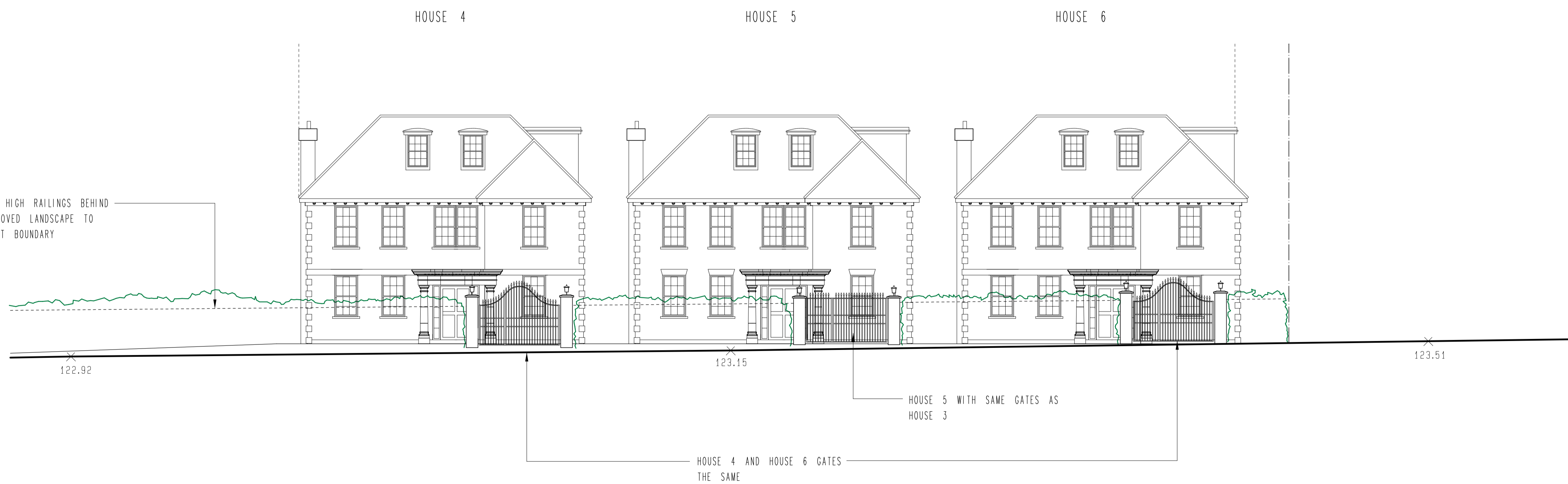
PROPOSED HOUSES ONTO GOLF CLUB ROAD