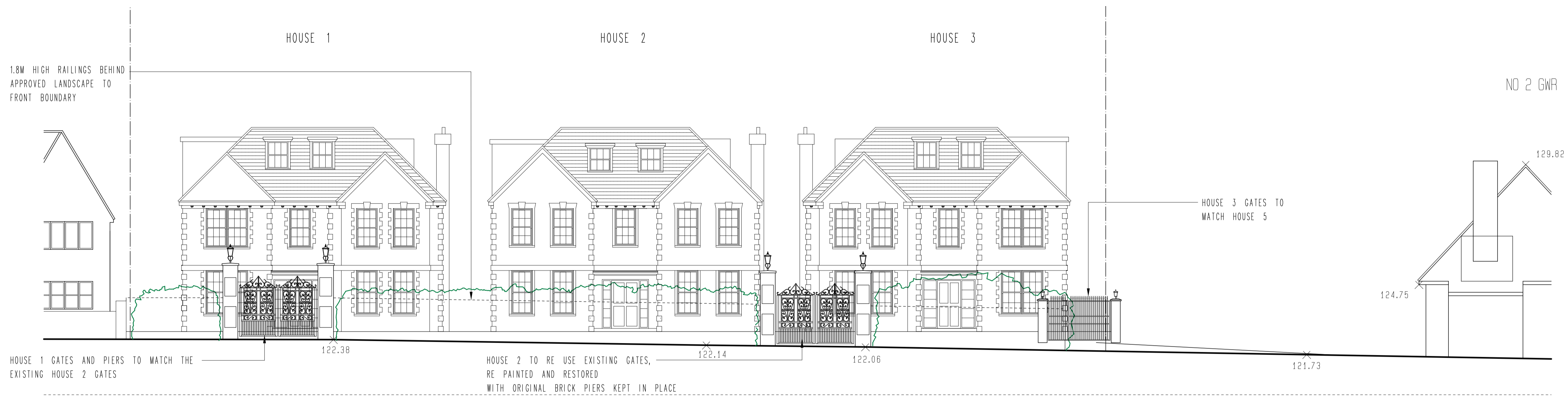
PROPOSED HOUSES ONTO BROOKMANS AVENUE