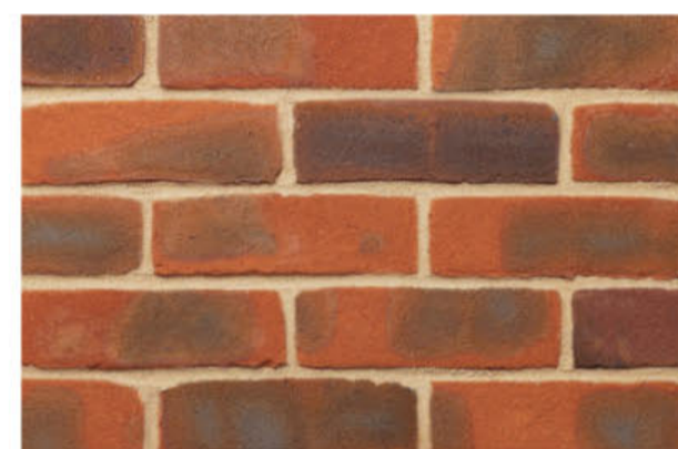
MICHELMERSH HAMPSHIRE STOCK RED MULTIATR