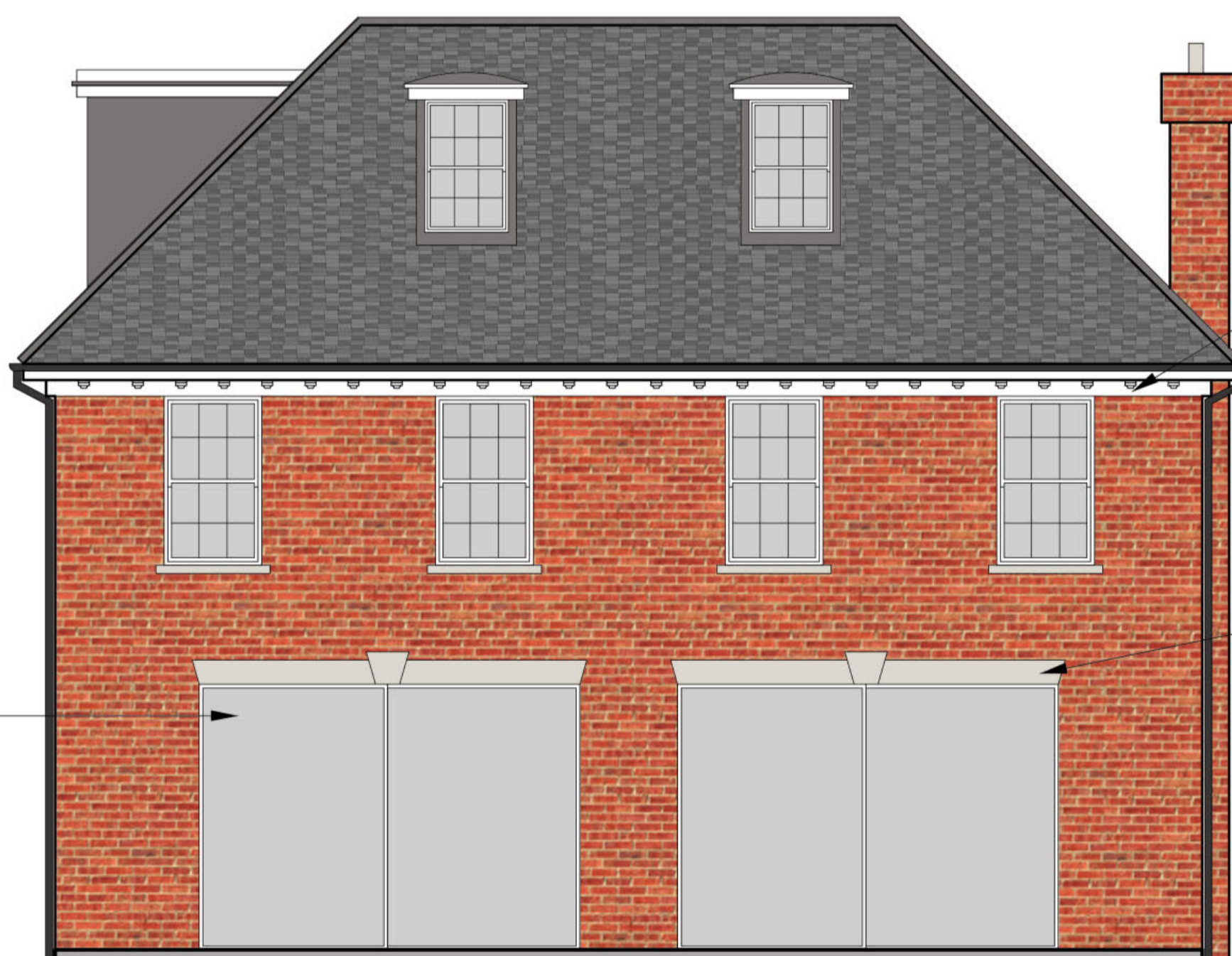
TYPICAL FRONT ELEVATION