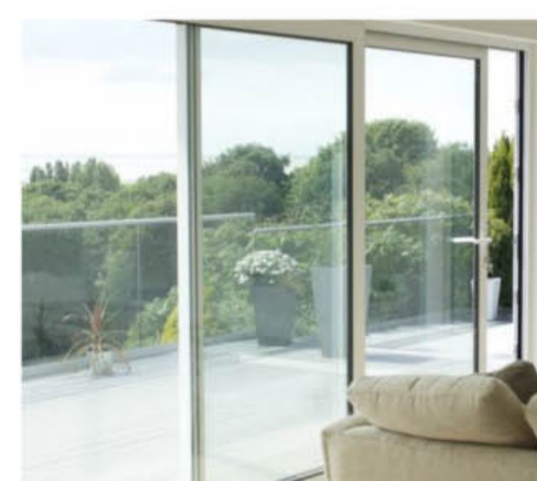
WHITE ALUMINIUM PATIO DOORS TO REAR