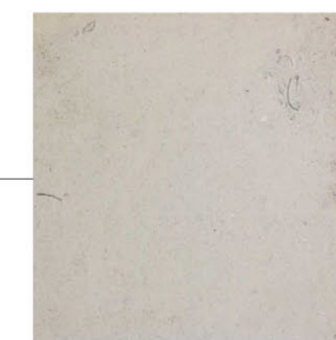
RECONSTITUTED PORTLAND STONE SURROUNDS BY KEYSTONE OR SIMILAR