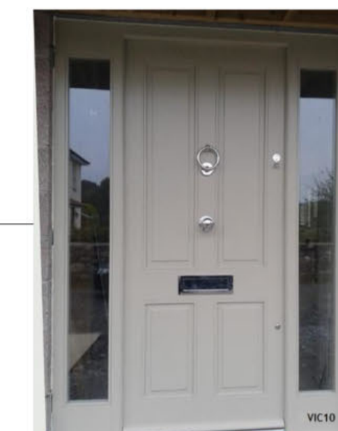
TIMBER FRONT DOOR