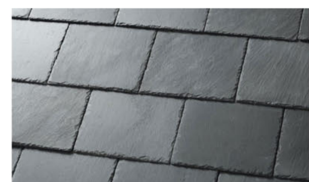
CHINESE OR SPANISH SLATE