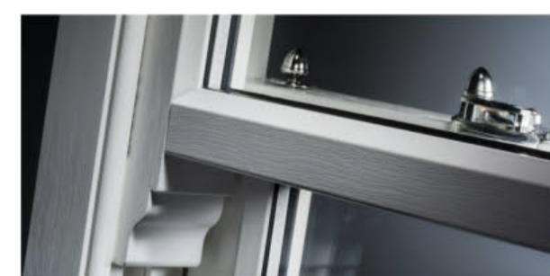
TIMBER STYLE UPVC SASH WINDOWS