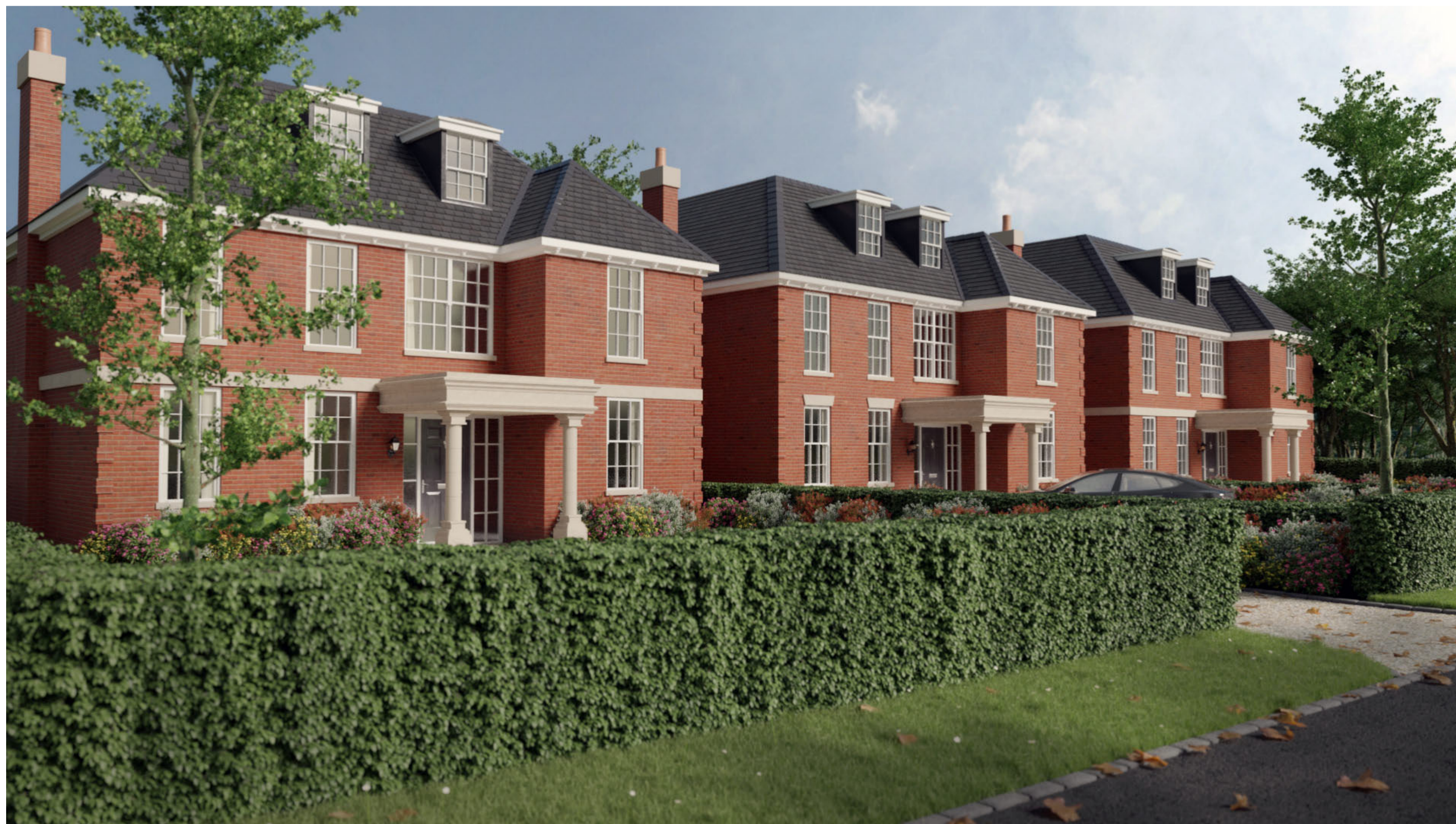
HOUSE 3/4/5 VIEW