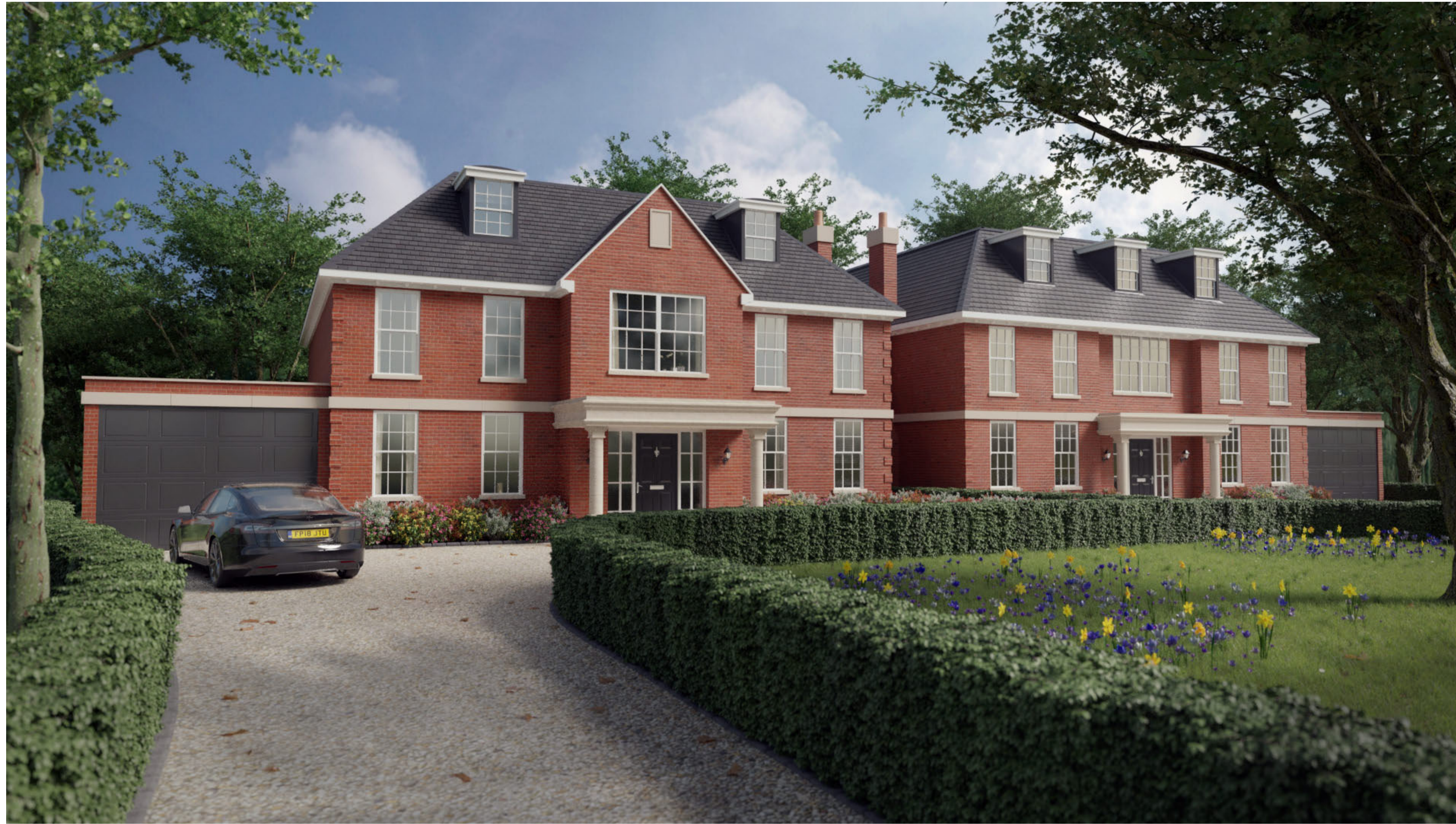
HOUSE 1/2 VIEW