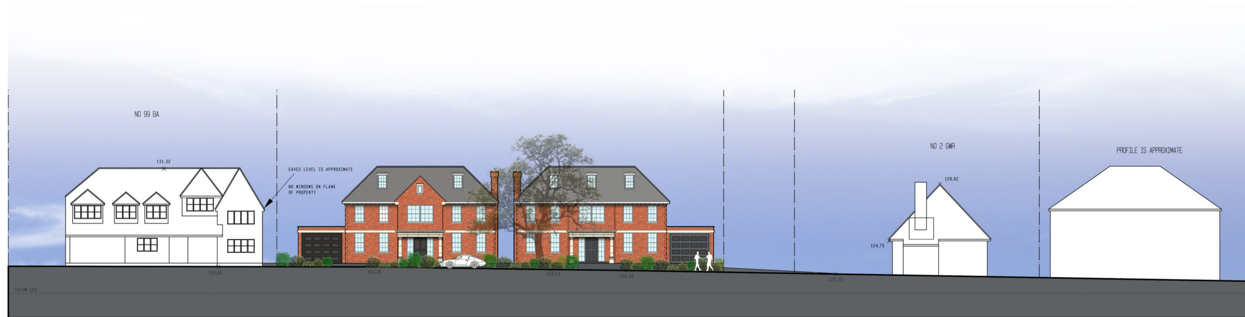
STREET SCENE ALONG BROOKMANS AVENUE AND GEORGES WOOD ROAD