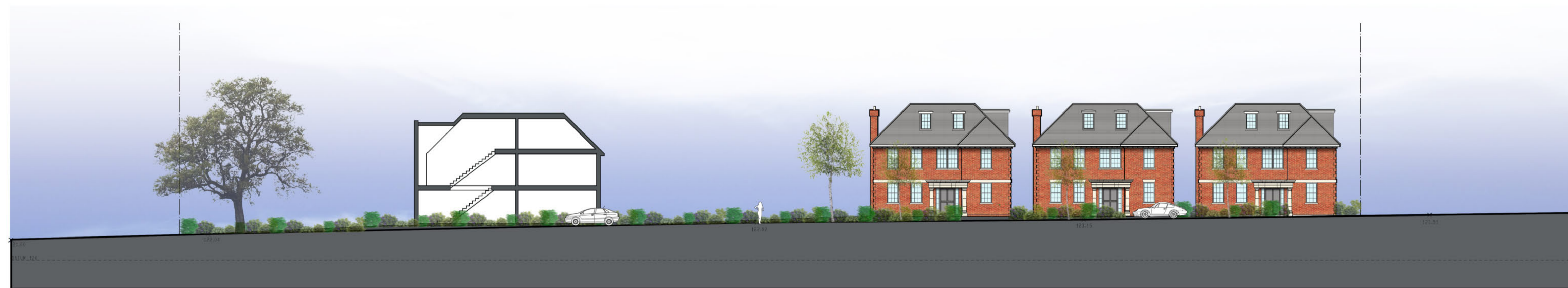
STREET SCENE ALONG GOLF CLUB ROAD