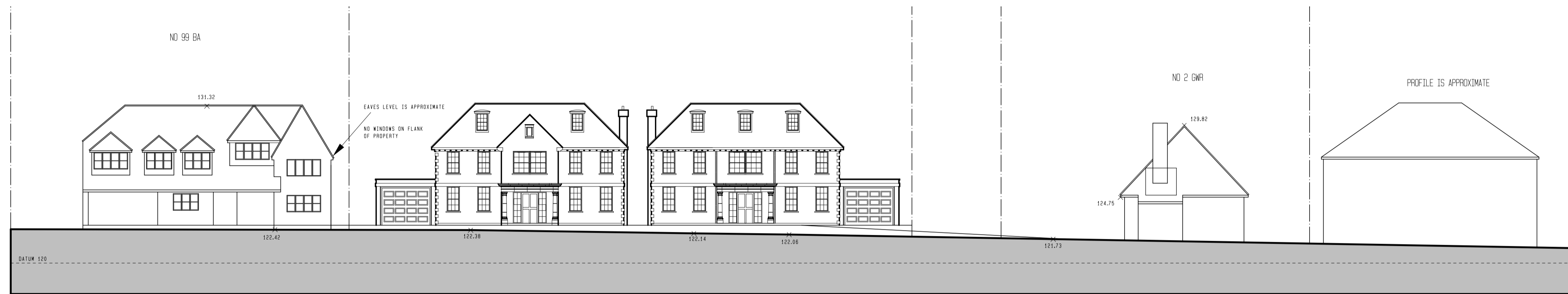
STREET SCENE ALONG BROOKMANS AVENUE AND GEORGES WOOD ROAD