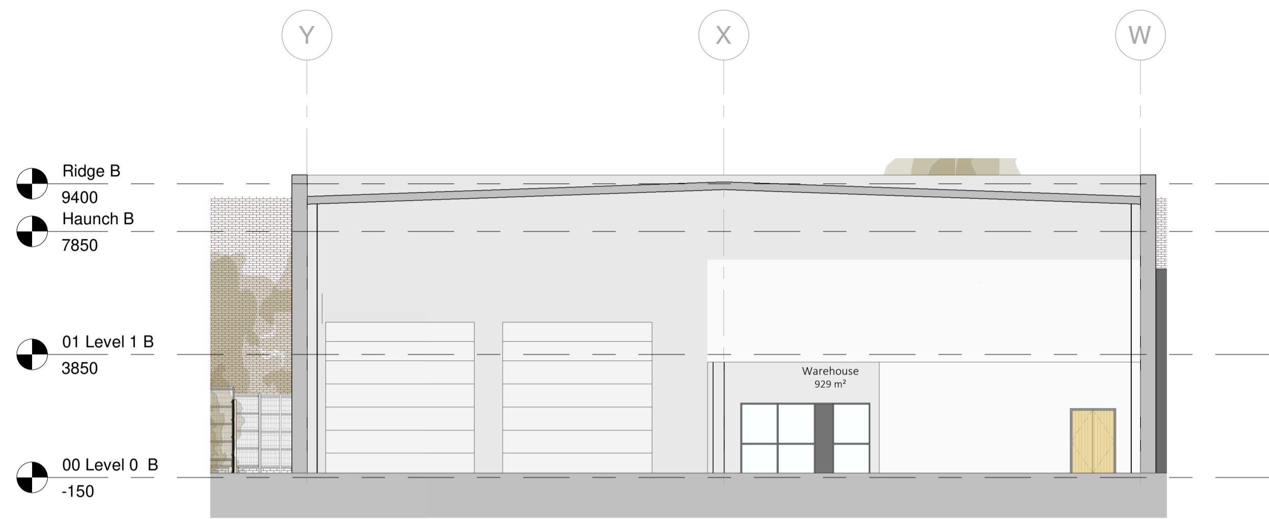
1 - Building B - Section AA 1:125