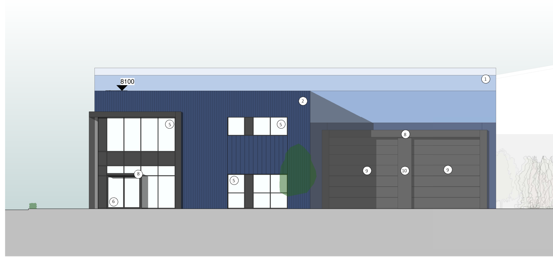
1 - Building B - Proposed North Elevation 1 : 125