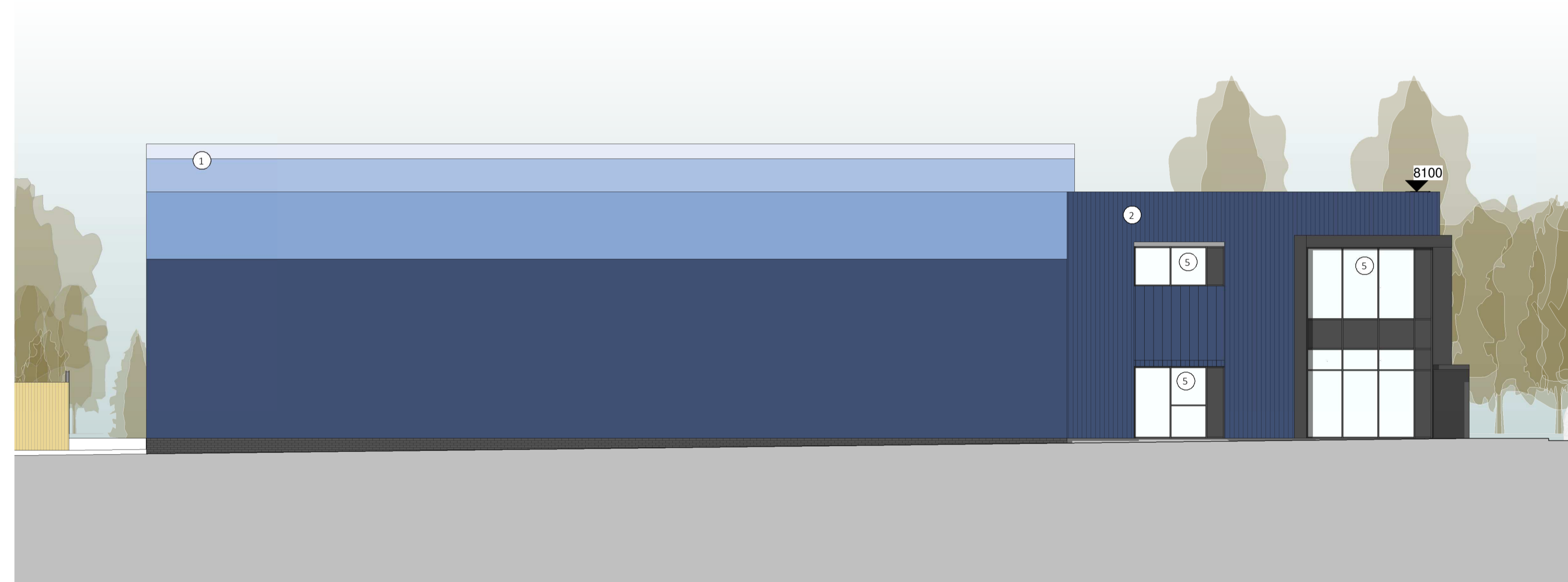
2 - Building B - Proposed East Elevation 1 : 125