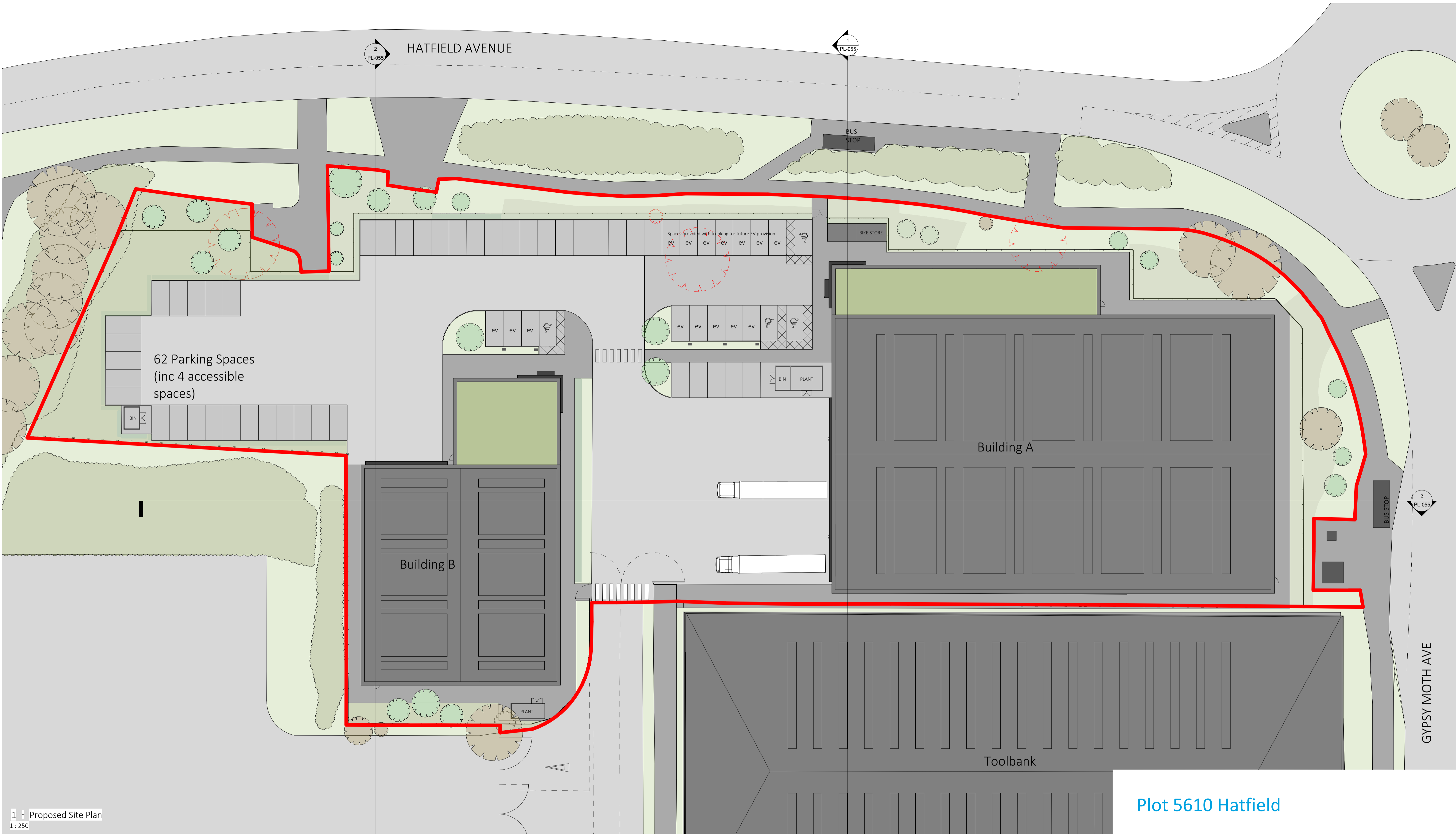
1 Proposed Site Plan 1 : 250