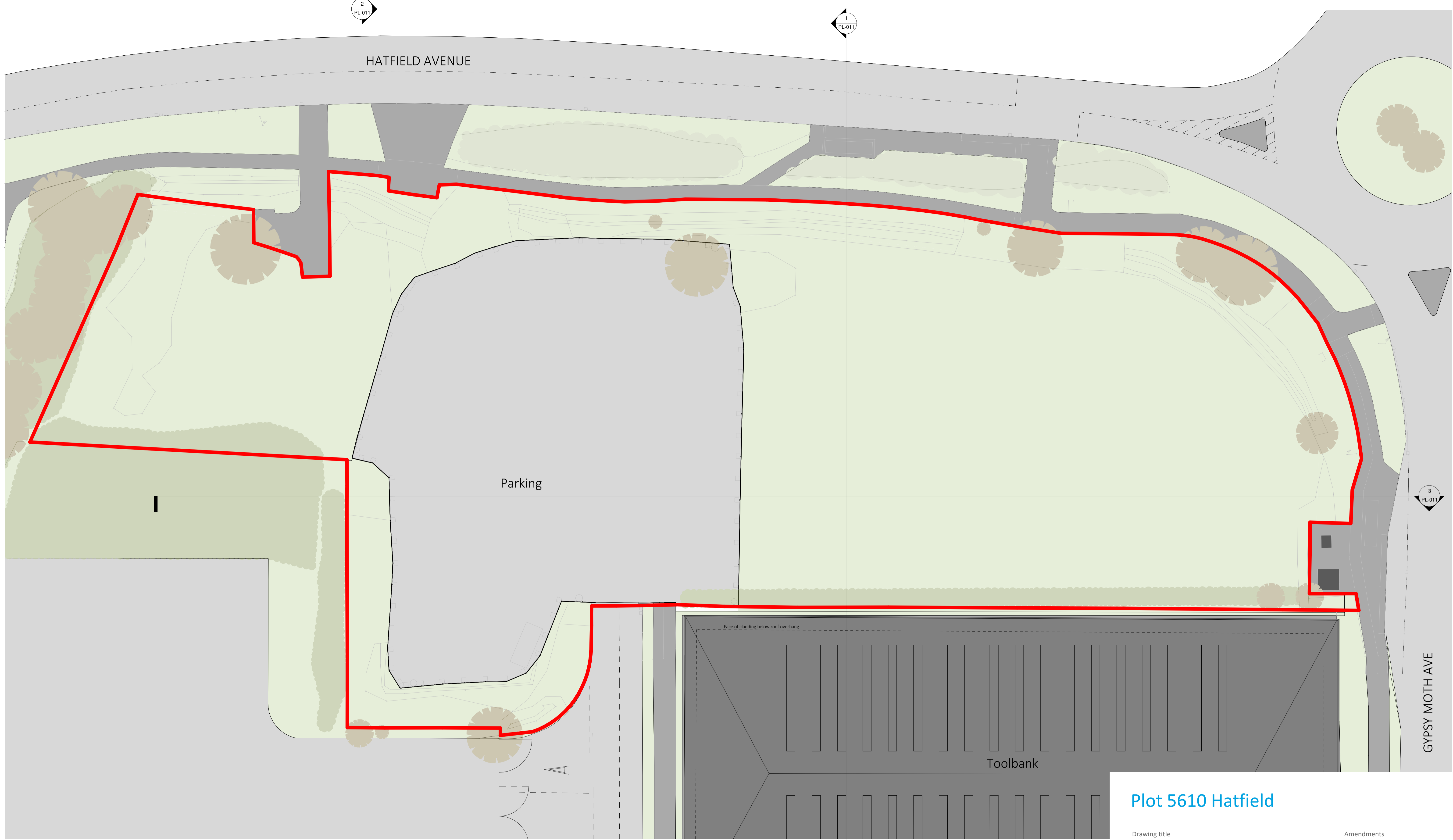
1 - Existing Site Plan 1 : 250