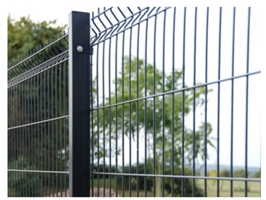
4. Illustrative example of V Mesh Gate Fence