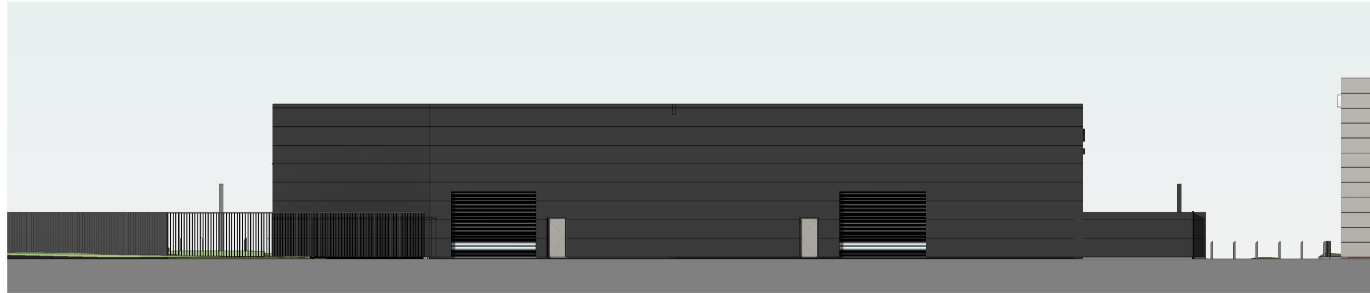
2 Aston Martin & McLaren North Elevation 1 : 200