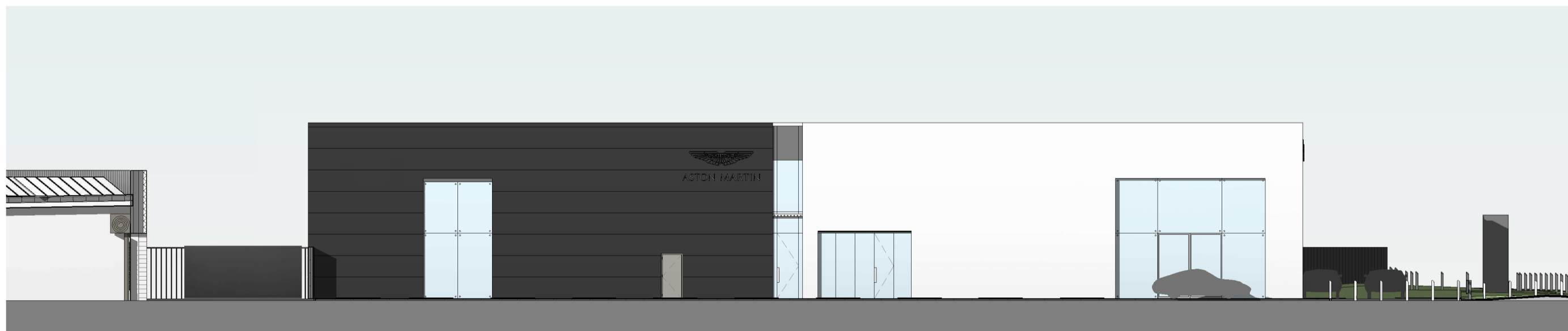
4 Aston Martin & McLaren West Elevation 1 : 200