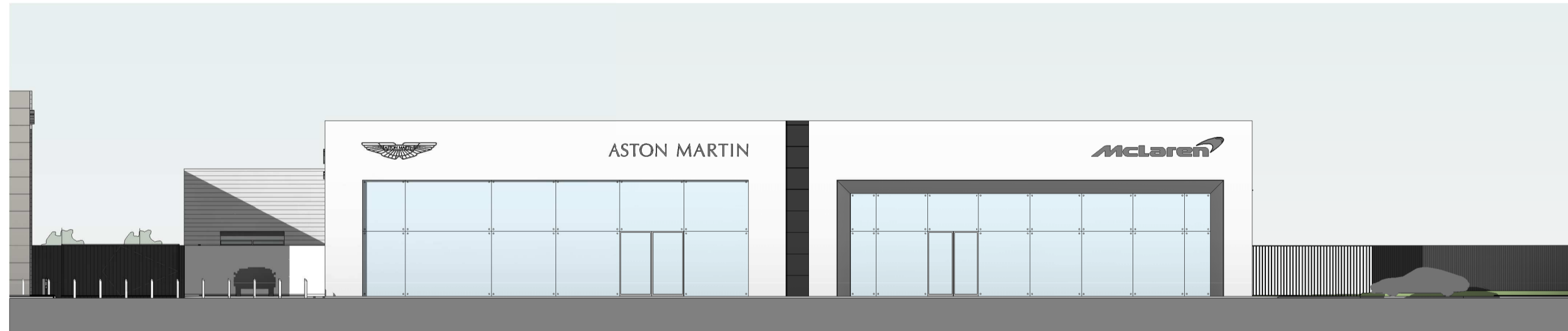
3 Aston Martin & McLaren South Elevation 1 : 200