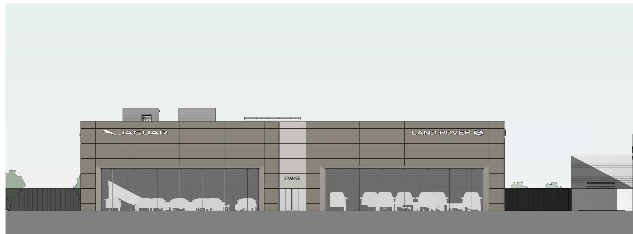
1 JLR South Elevation 1:200