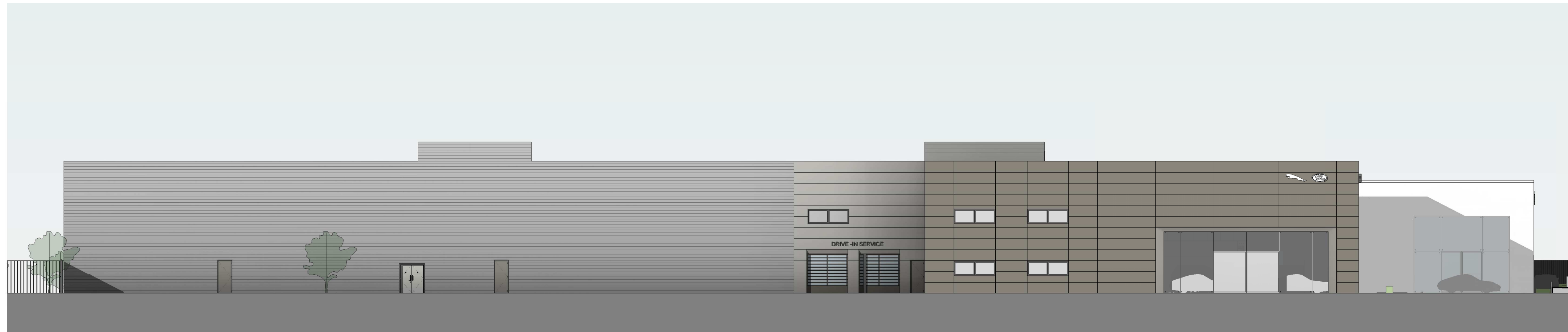
2 JLR West Elevation 1:200