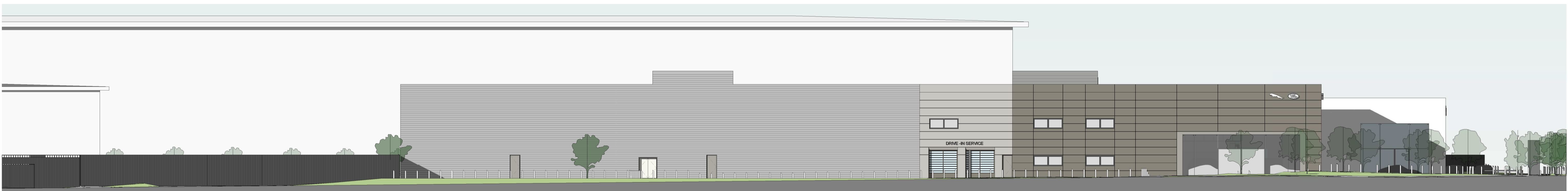
2 Proposed Site Elevation 2 1 : 200