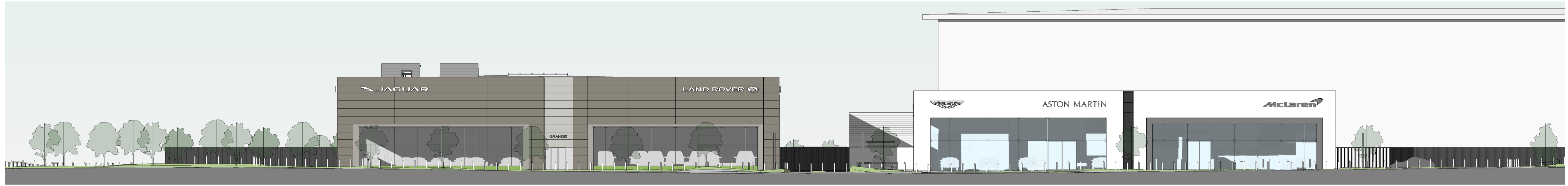
1 Proposed Site Elevation 1 1 : 200