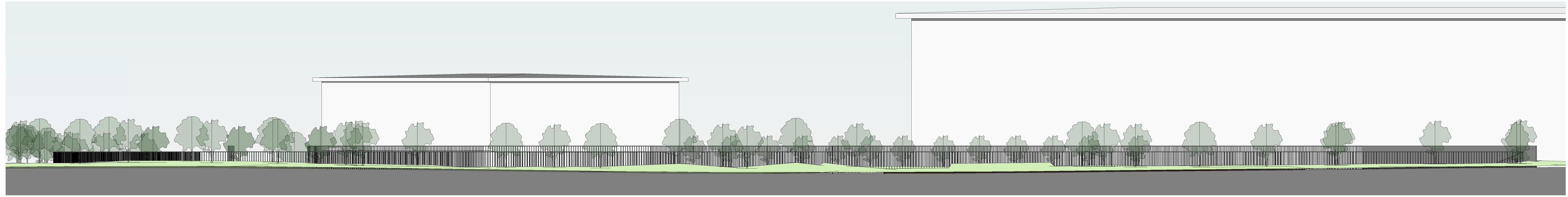
1 Existing Site Elevation 1 1 : 200