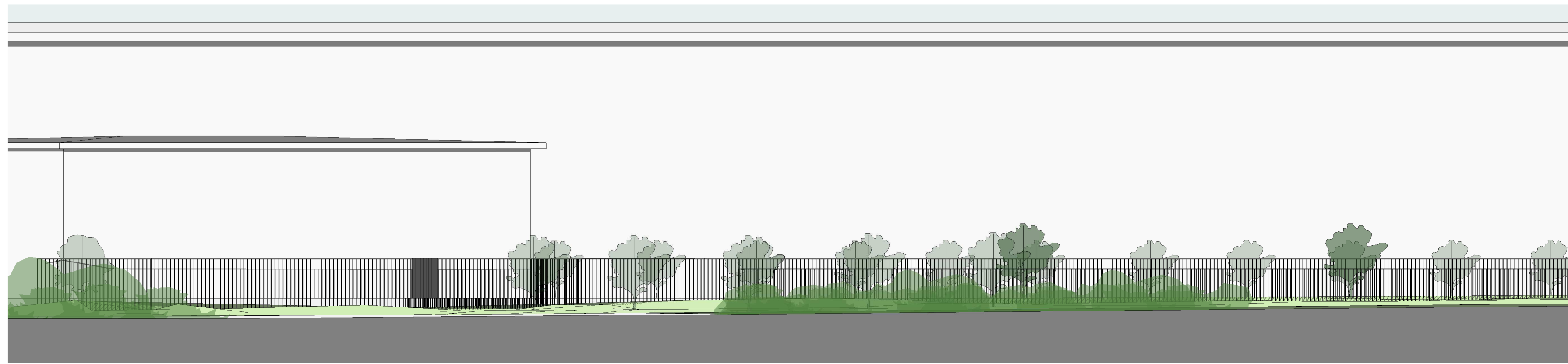
2 Existing Site Elevation 2 1 : 200