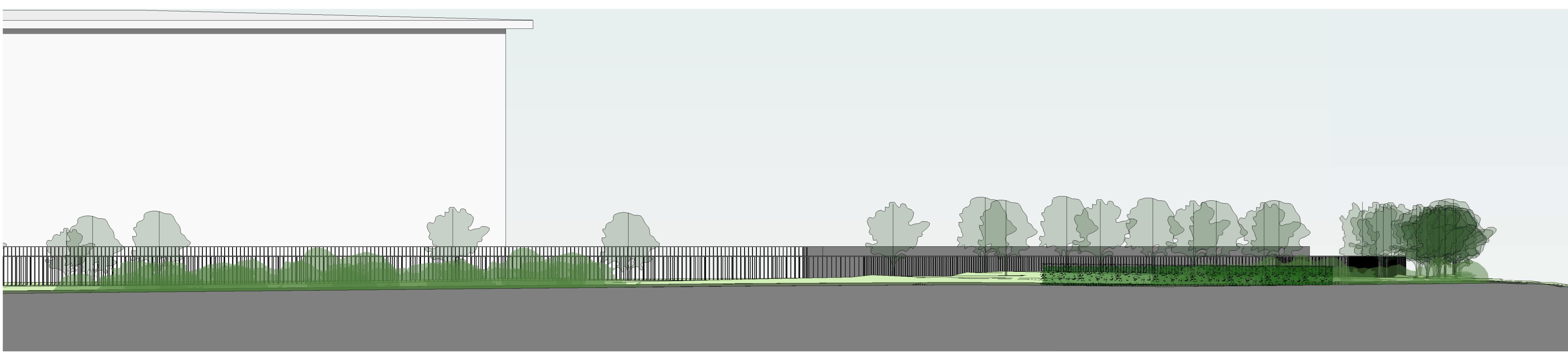
3 Existing Site Elevation 2 Part 2 1 : 200