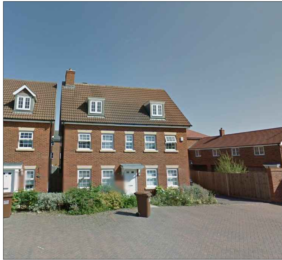
View From Front