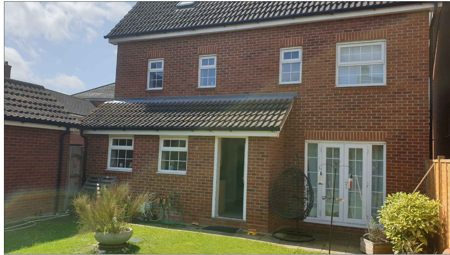
View From Rear

GENERAL NOTE THIS DRAWING IS THE PROPERTY OF INK2DESIGN LTD. IT MAY NOT BE COPIED OR DISCLOSED TO ANY THIRD PARTY FOR ANY PURPOSE EXCEPT AS AUTHORISED IN WRITING BY INK2DESIGN LTD. LARGE SCALE DRAWINGS TO BE USED IN PREFERENCE TO SMALL SCALE DRAWINGS. ALL DIMENSIONS ARE TO BE CHECKED ON SITE BEFORE ANY WORK PROCEEDS. ANY ERRORS OR OMISSIONS ARE TO BE REPORTED TO INK2DESIGN LTD. IF IN DOUBT ASK. THIS DRAWING IS TO BE READ IN CONJUNCTION WITH ALL THE RELEVANT CONSULTANTS AND/OR SPECIALIST DRAWINGS DOCUMENTS AND ANY DISCREPANCIES OR VARIATIONS ARE TO BE NOTIFIED TO INK2DESIGN LTD BEFORE THE AFFECTED WORK COMMENCES. PLEASE NOTE THE CONTRACTOR MUST AVOID FORESEEABLE RISKS TO THE HEALTH AND SAFETY OF THOSE WORKING ON OR OFF SITE ON THIS CONSTRUCTION AND AVOID THE USE OF ANY MATERIALS OR PRACTICES WHICH MIGHT BE HAZARDOUS OR CONTRAVENE ANY REGULATIONS.