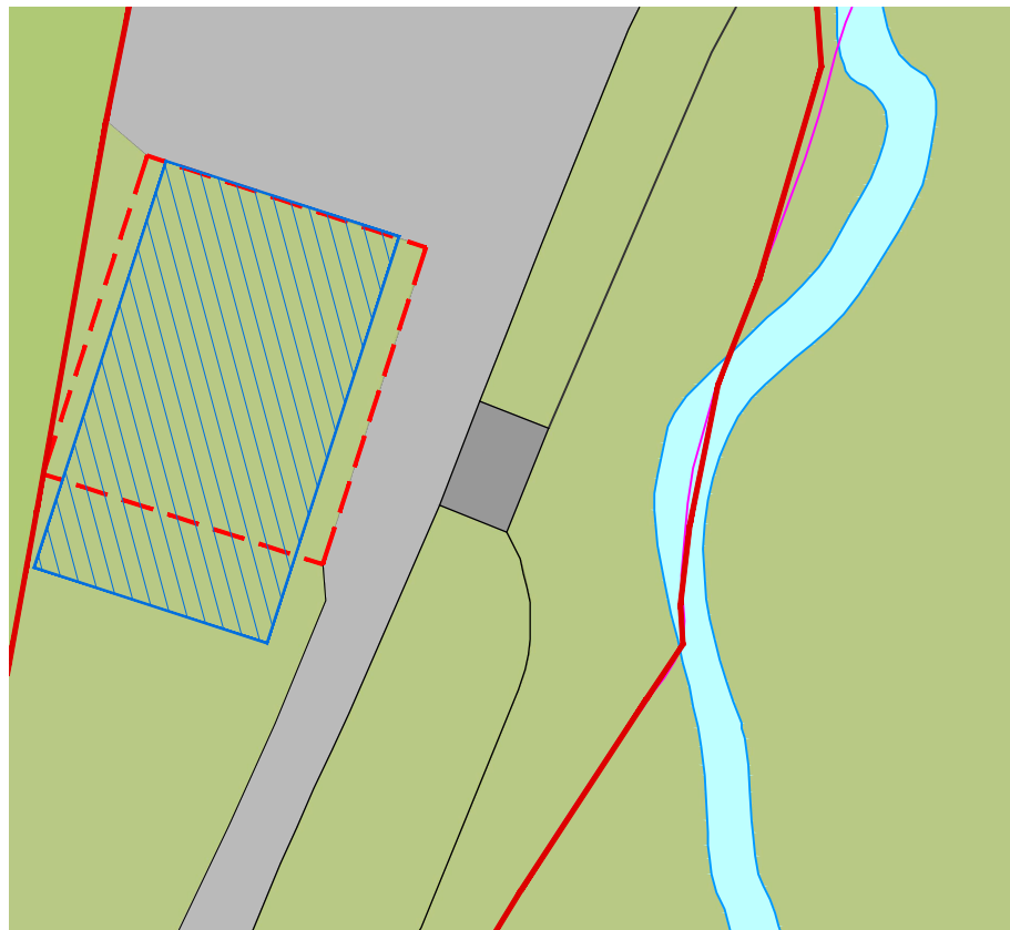
[02] BLOCK PLAN 1:500