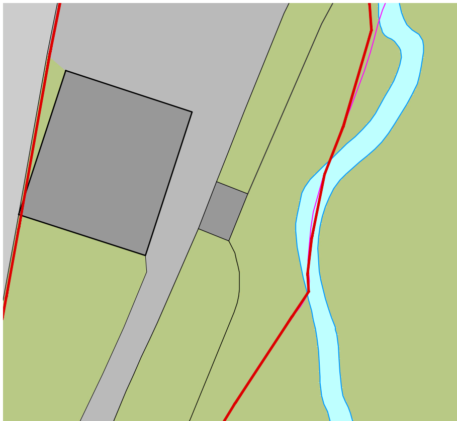
[02] BLOCK PLAN 1:500