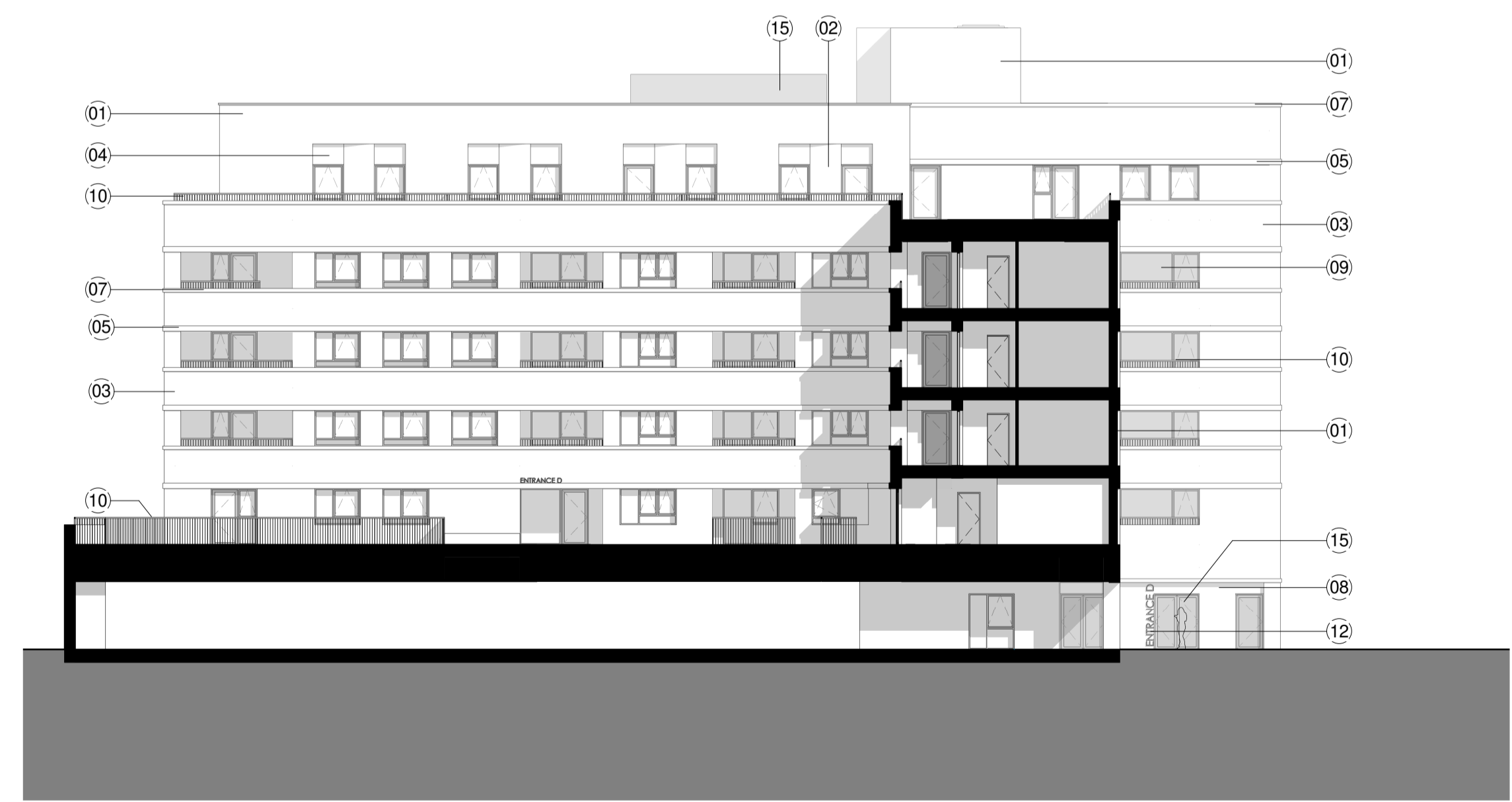
8 - North courtyard elevation (South) 1 : 200