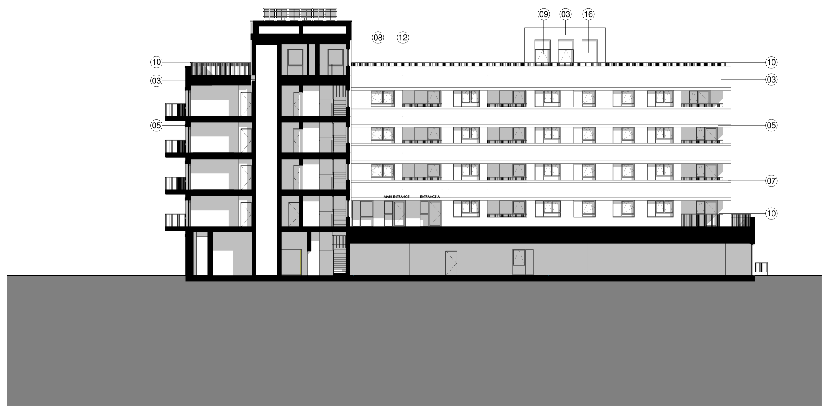
5 - South courtyard elevation (North) 1 : 200