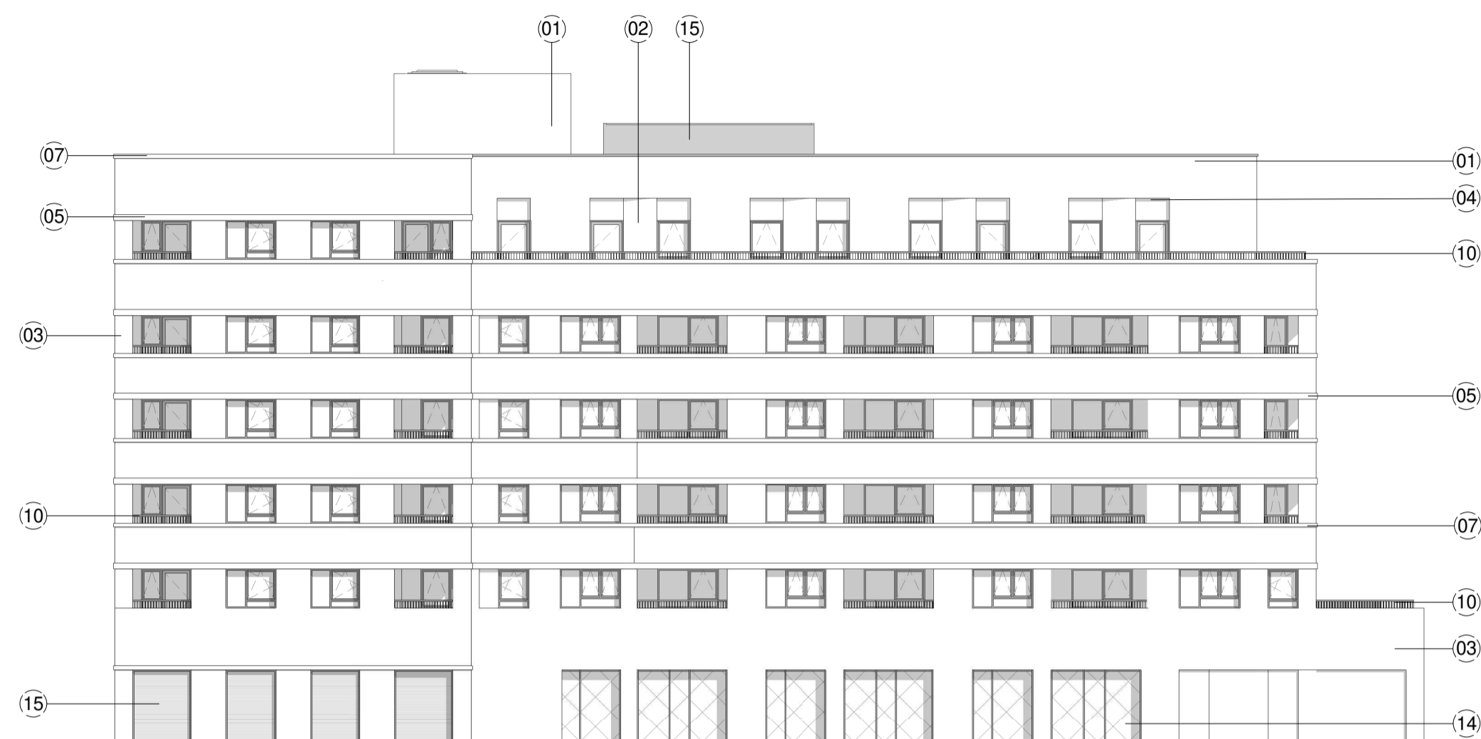
3 - Rear Elevation (North) 1 : 200