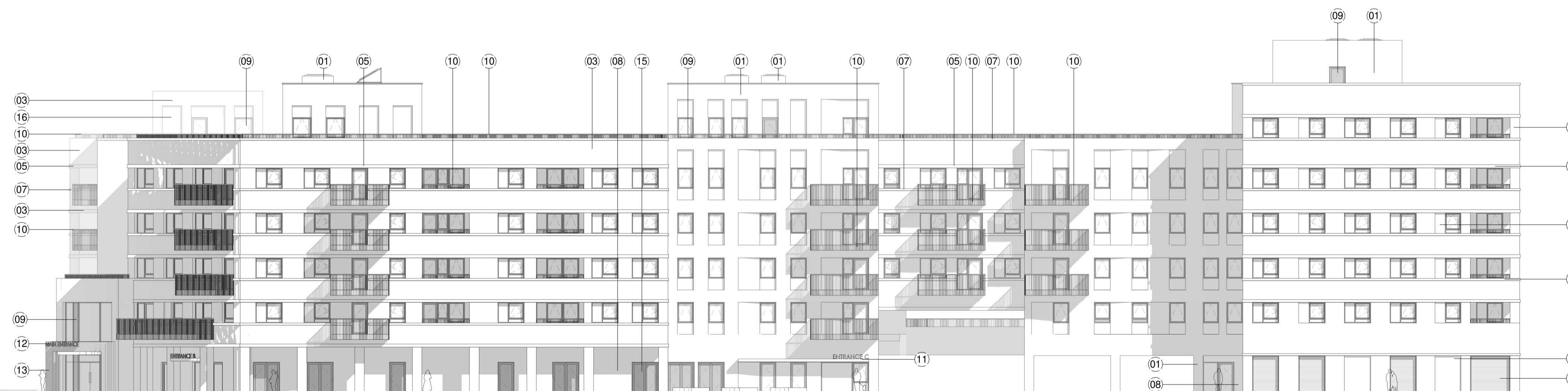
4 - Side Elevation (East) 1 : 200