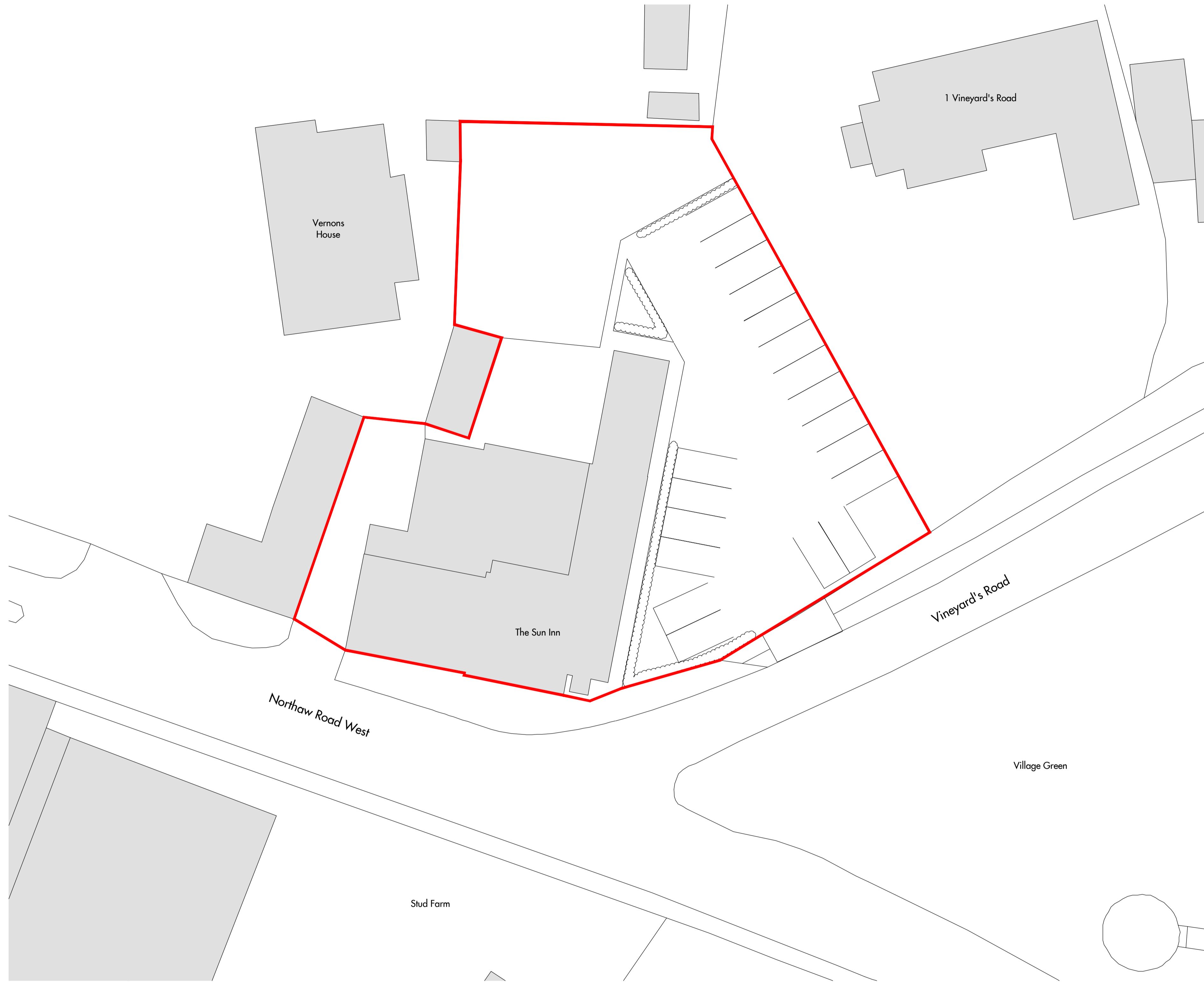
Proposed Site Plan Scale 1:200

Boundary: — boundary referenced from OS Map