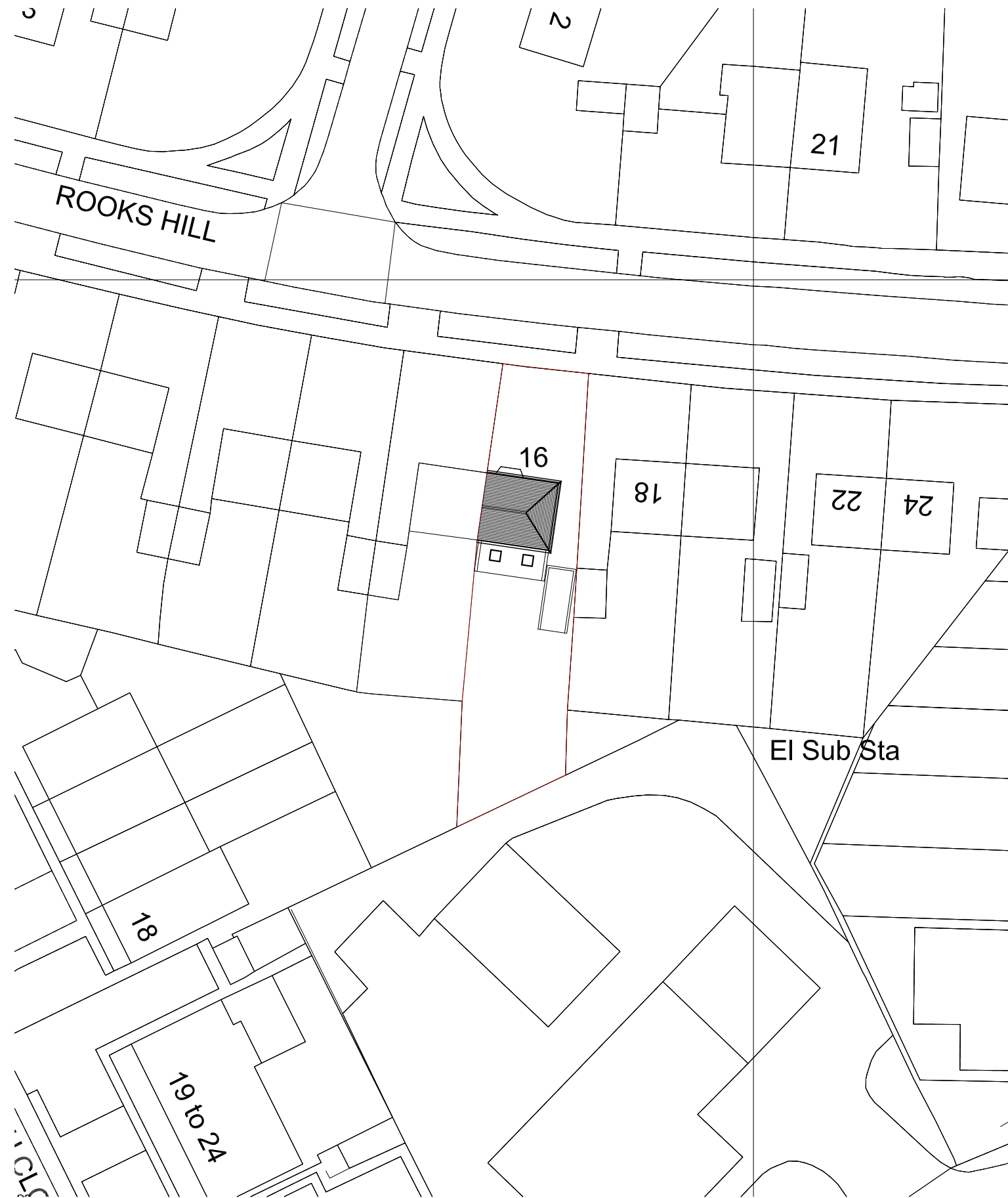
PROPOSED SITE PLAN 1:500