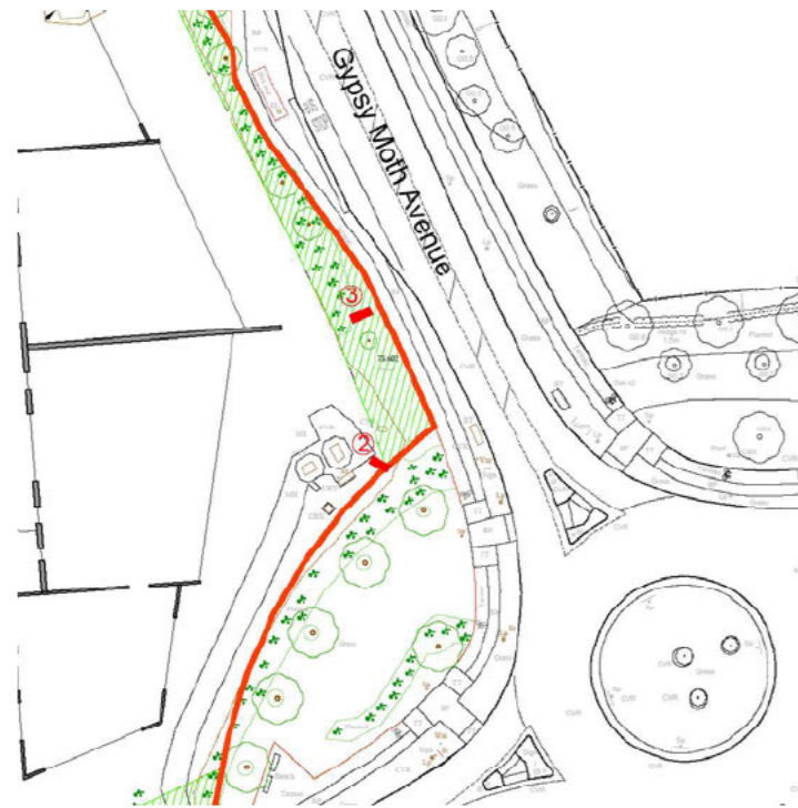
Partial Site Plan - Location 2