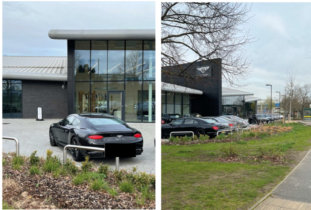
Location 2 - Existing Site Photographs