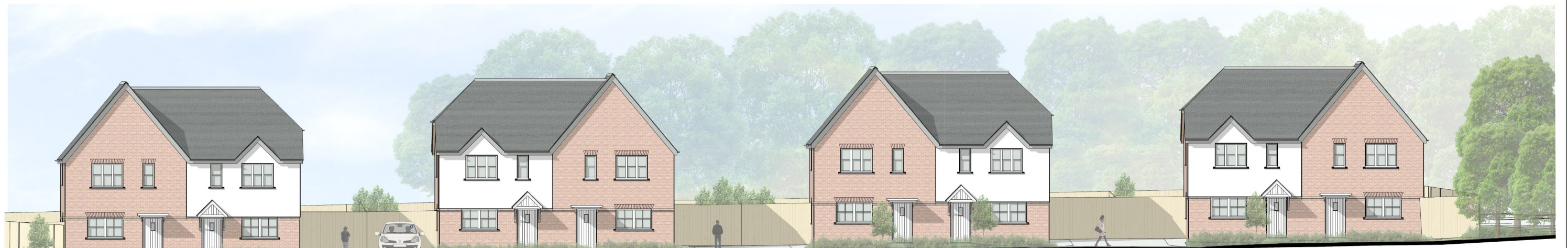
Plot 14 Plot 15 Plot 16 Plot 17 Plot 18 Plot 19 Plot 20 Plot 21