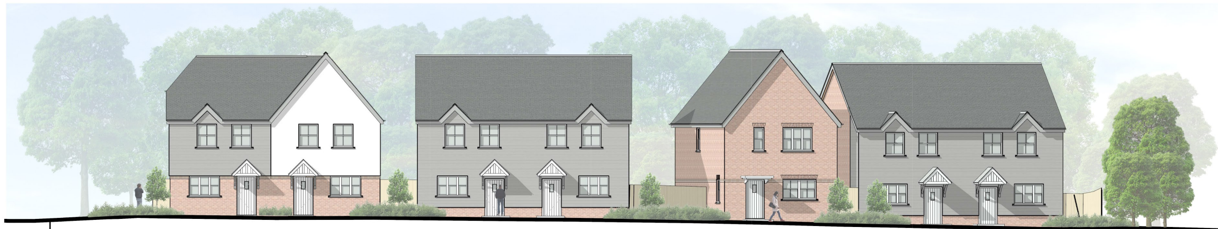
Site boundary Plot 1 Plot 2 Plot 3 Plot 4 Plot 5 Plot 6 Plot 7 Site boundary