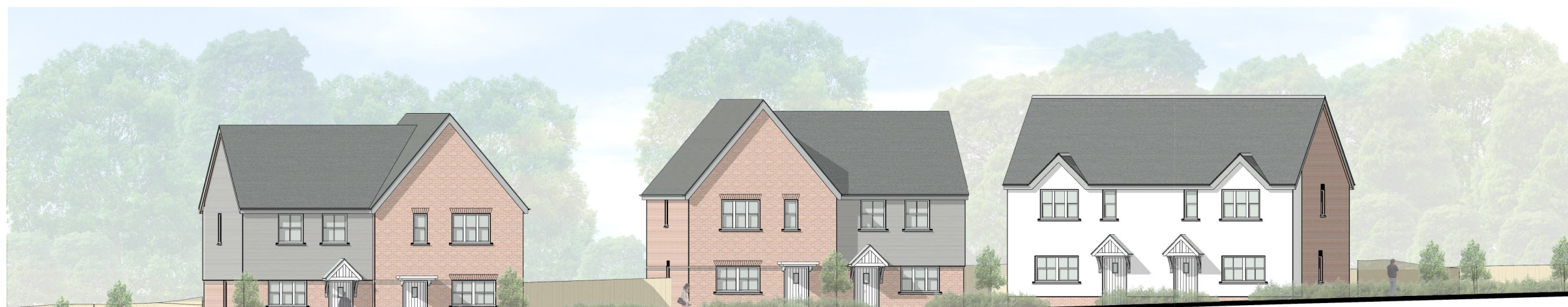
Plot 8 Plot 9 Plot 10 Plot 11 Plot 12 Plot 13