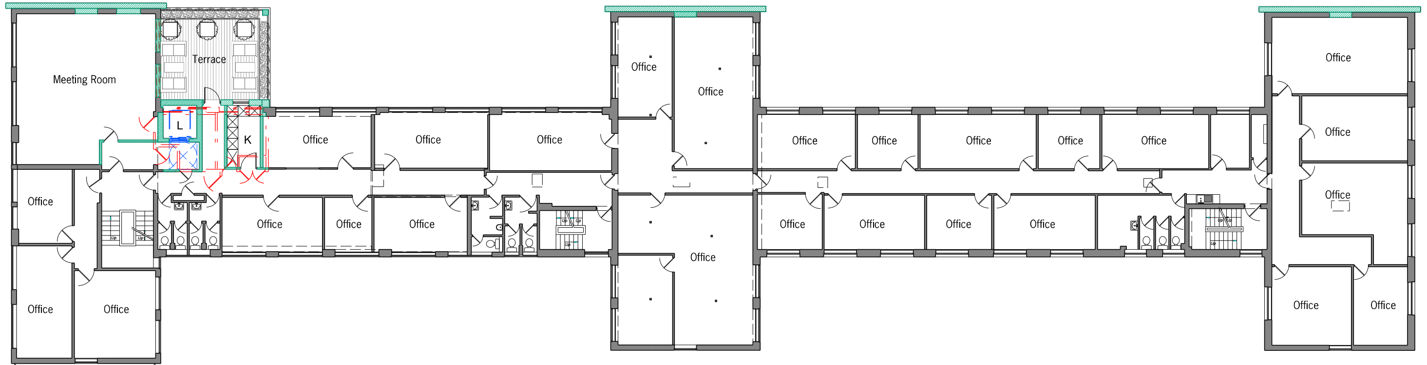
01 Proposed Second Floor Plan 1:200@A3