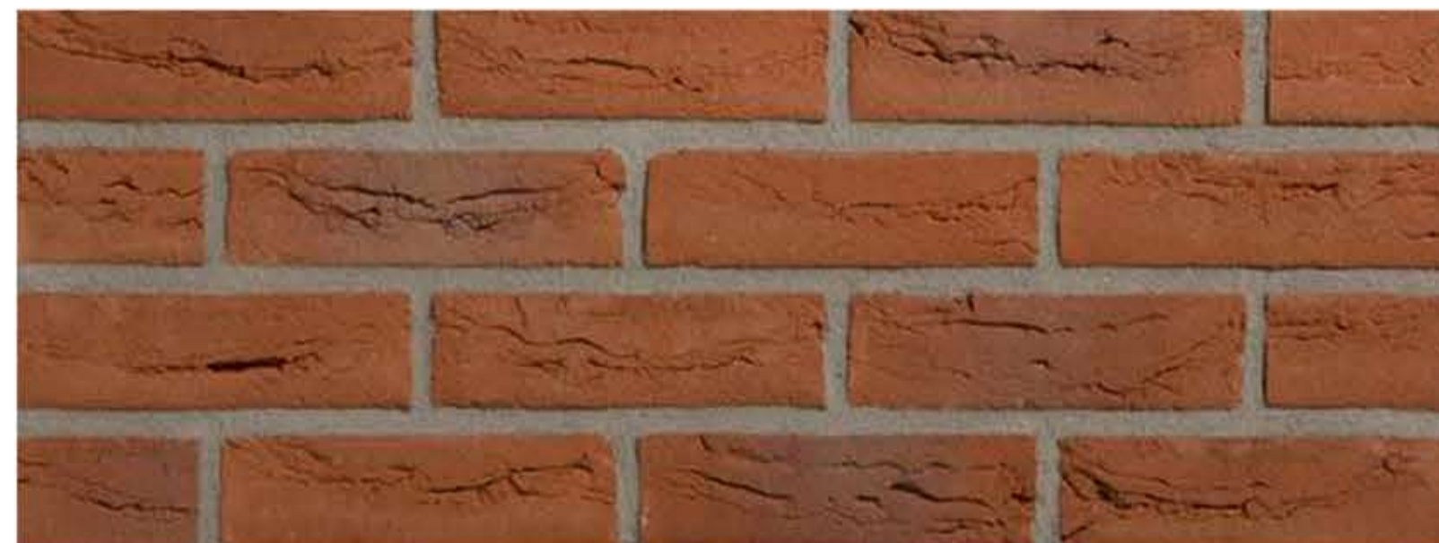
BRICKWORK Red Multi Handmade AAB Bricks