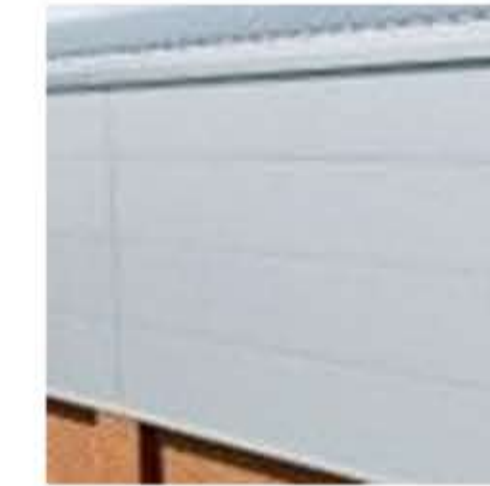
WALL CLADDING Kingspan KS1000 PL (plank) longspan panels