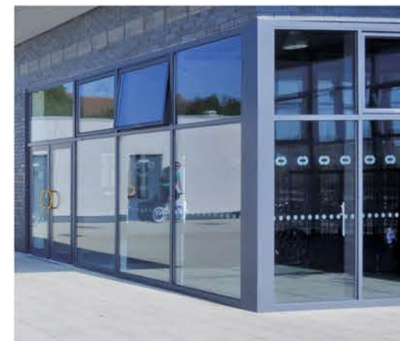
WINDOWS & DOORS Polyester Powder Coated Aluminium double glazed units