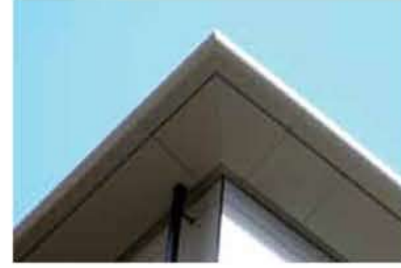
EAVES & RAINWATER Dales Fabrications Bullnose Fascia with Hidden Gutter, Secret-Fix Soffit Panel & Rainwater Pipe.