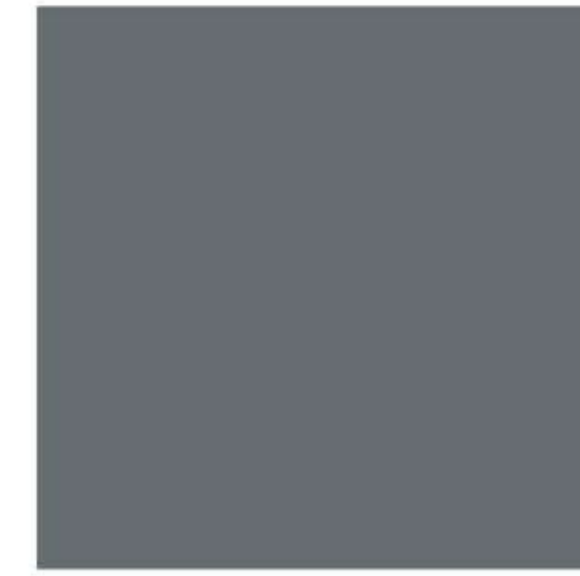
FINISH RAL 7012 Basalt Grey