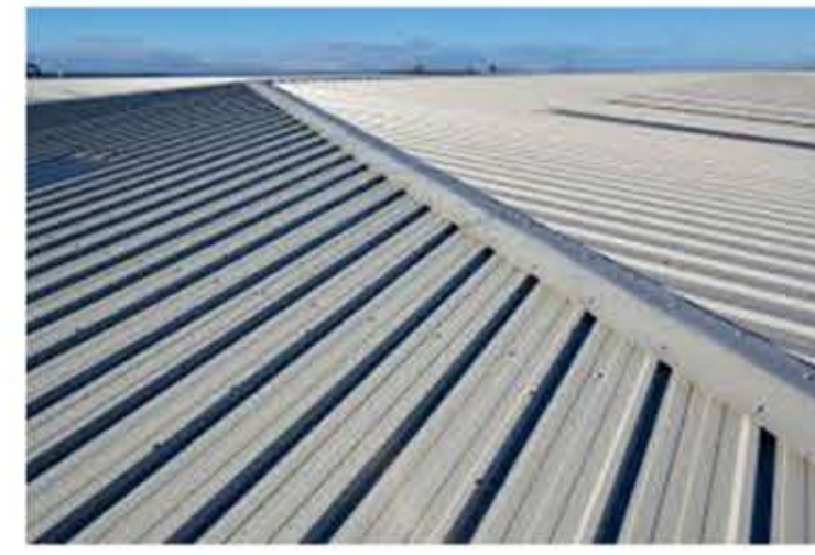
ROOF COVERING Kingspan KS1000RW Trapezoidal insulated panels