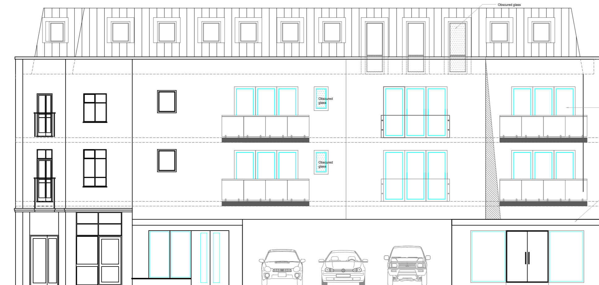
PROPOSED RIGHT SIDE ELEVATION