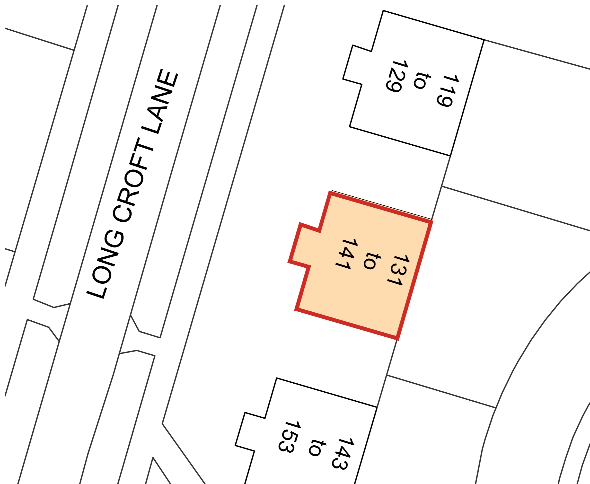
Block Plan ( Scale 1:500 )

PLEASE CONSULT THE AUTHOR OR PROJECT MANAGER SHOULD THE READER REQUIRE CLARIFICATION ON ANY PART OF THIS DRAWING.