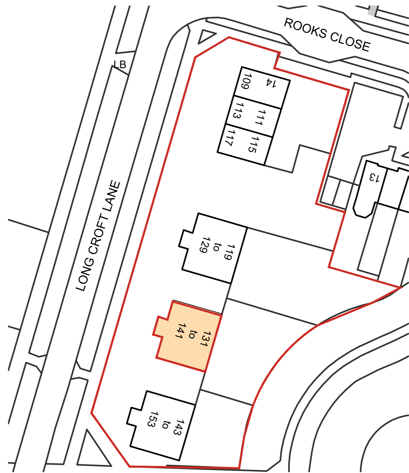
Site Location Plan ( Scale 1:1250 )

ALL DIMENSIONS, LEVELS AND CLEARANCES TO BE CHECKED ON SITE PRIOR TO WORKS COMMENCING