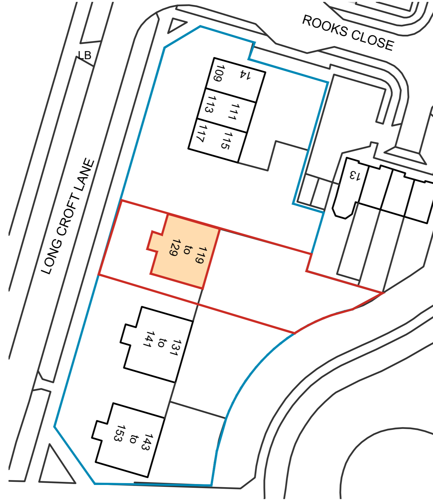
Site Location Plan ( Scale 1:1250 )