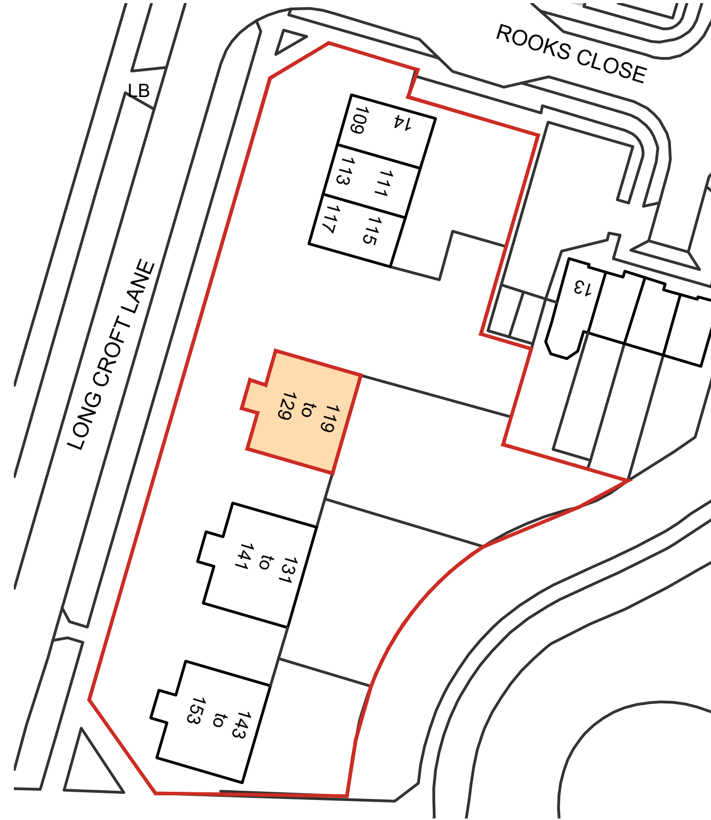
Site Location Plan ( Scale 1:1250 )