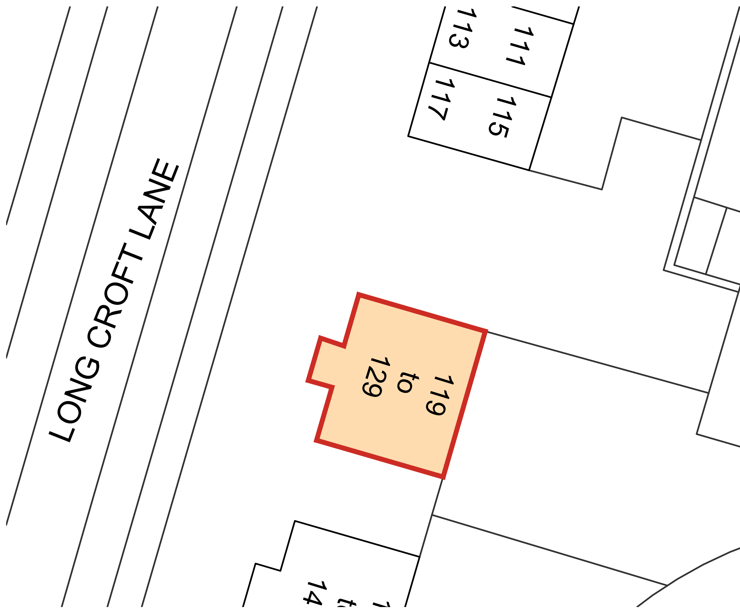
Block Plan ( Scale 1:500 )

ALL DIMENSIONS, LEVELS AND CLEARANCES TO BE CHECKED ON SITE PRIOR TO WORKS COMMENCING