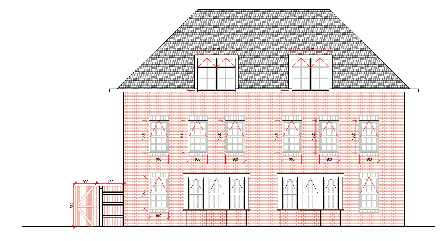
Block 2 Elevation D-D