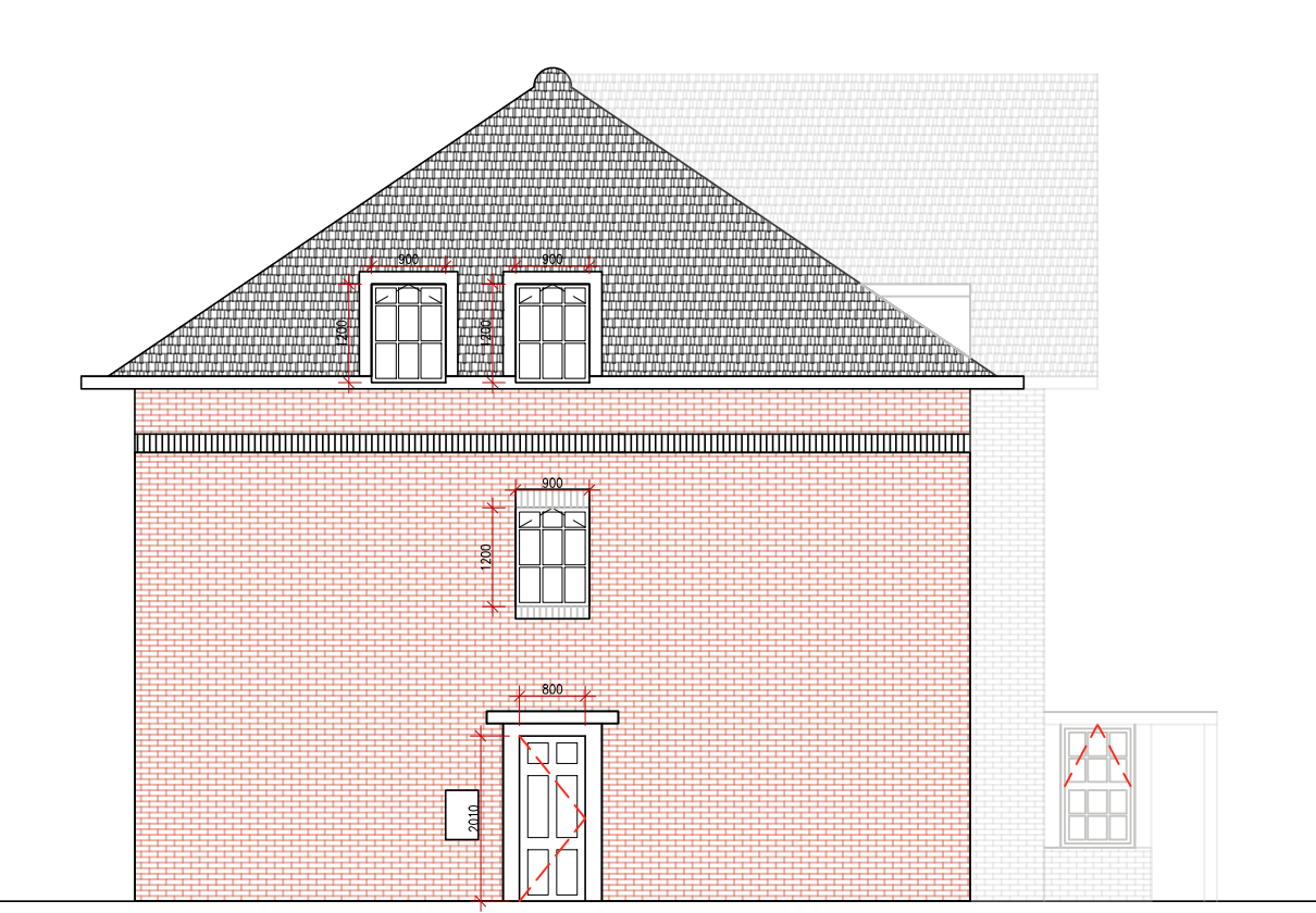
Block 2 Elevation C-C