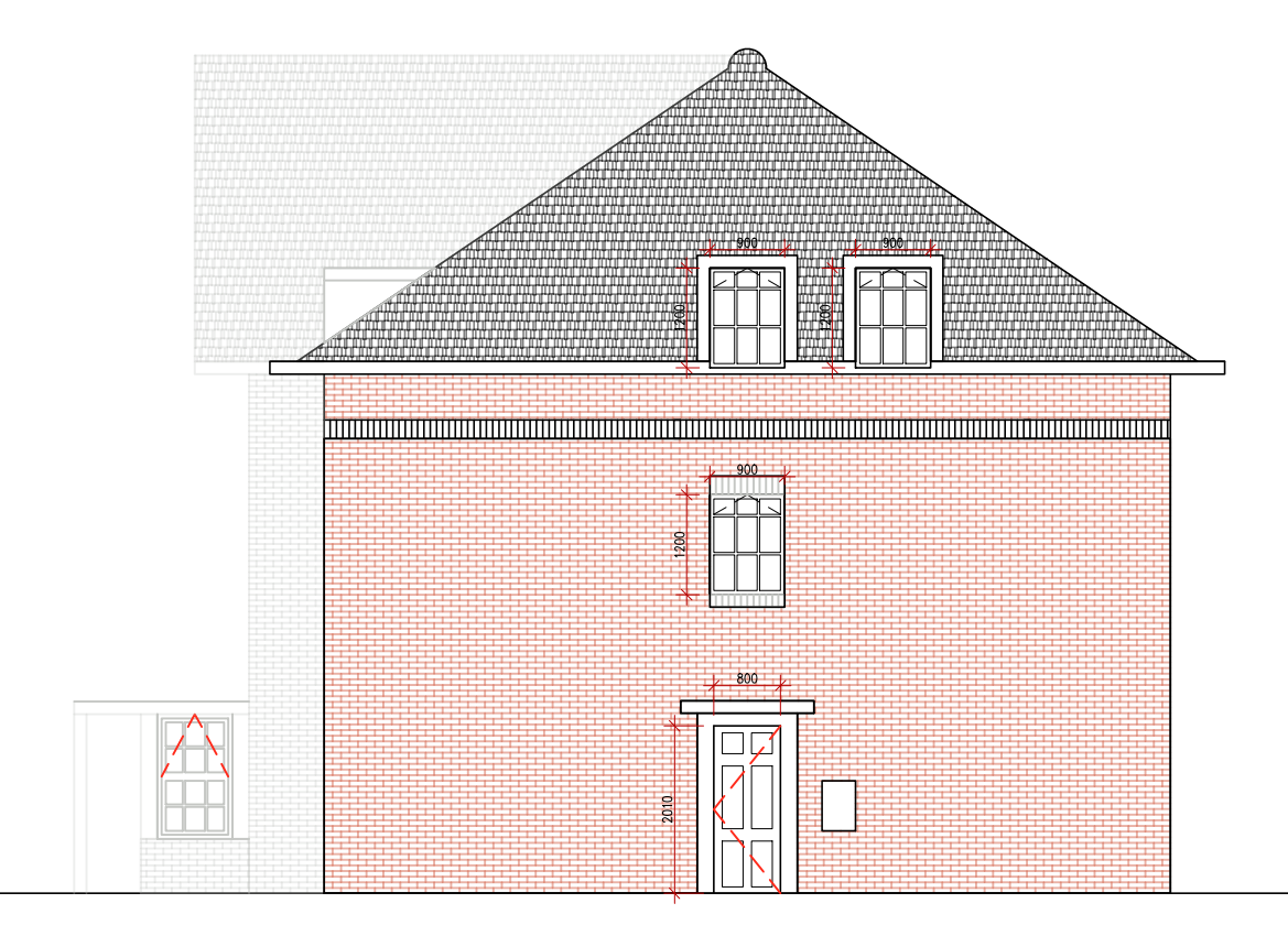
Block 2 Elevation B-B