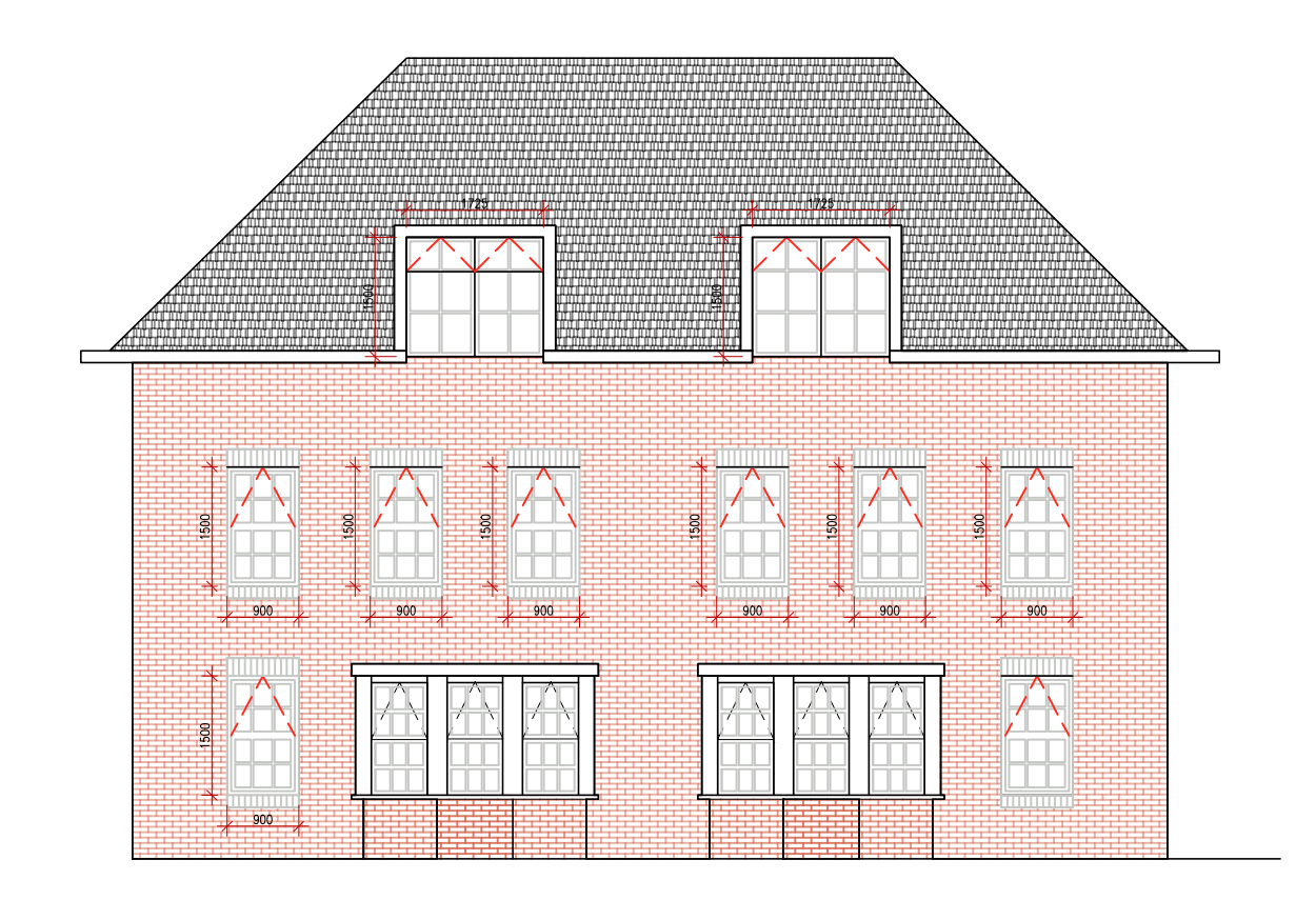
Block 2 Elevation D-D