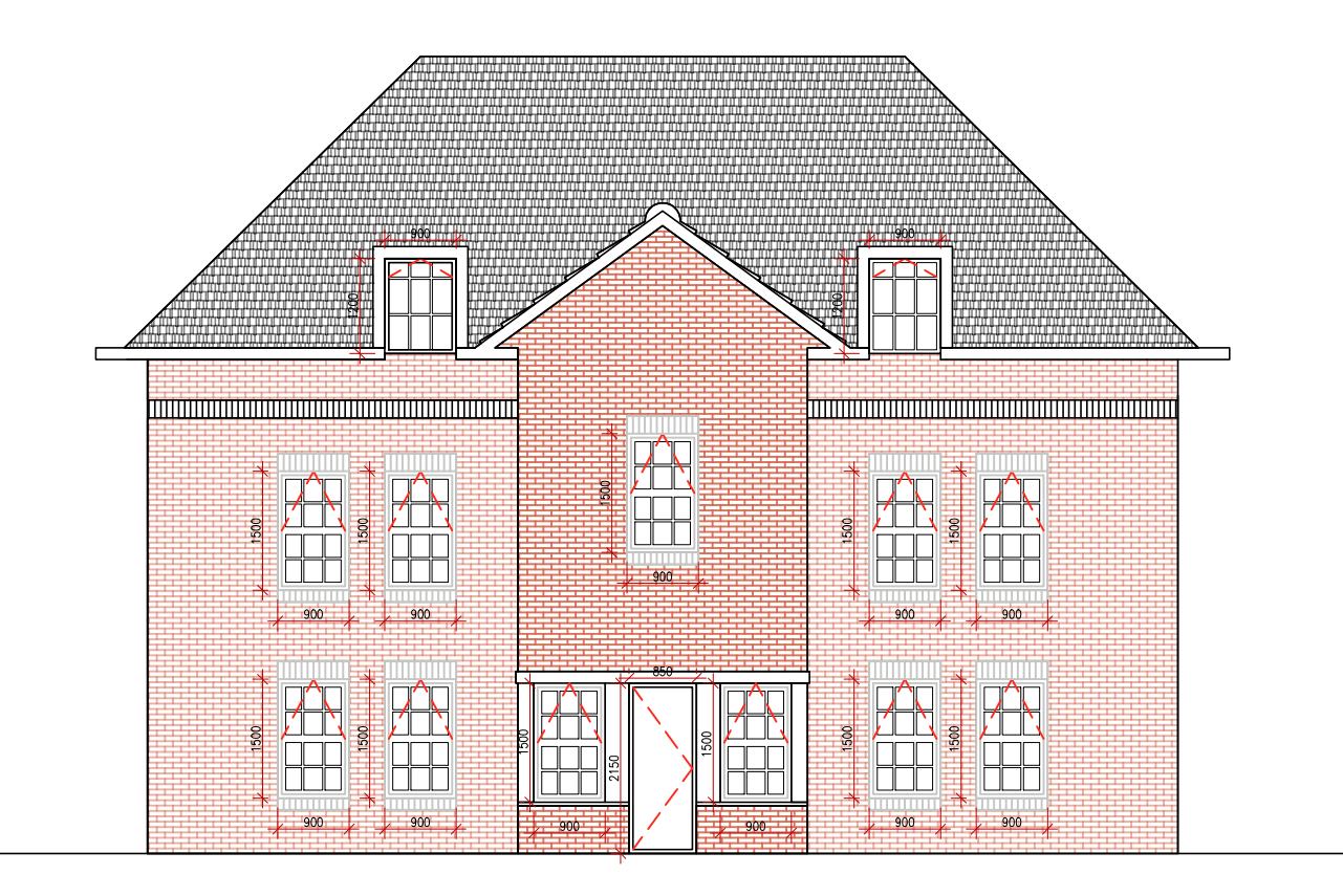
Block 2 Elevation A-A