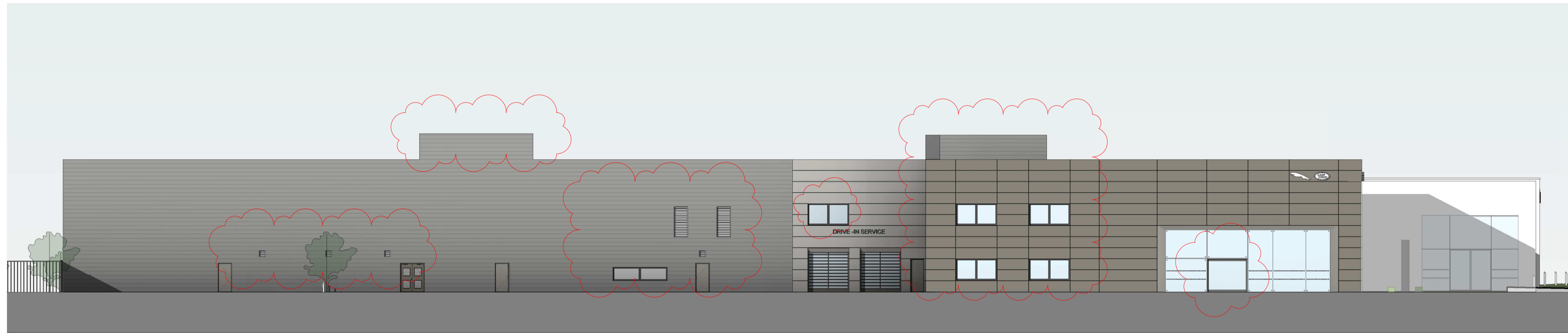
2 JLR West Elevation 1 : 200