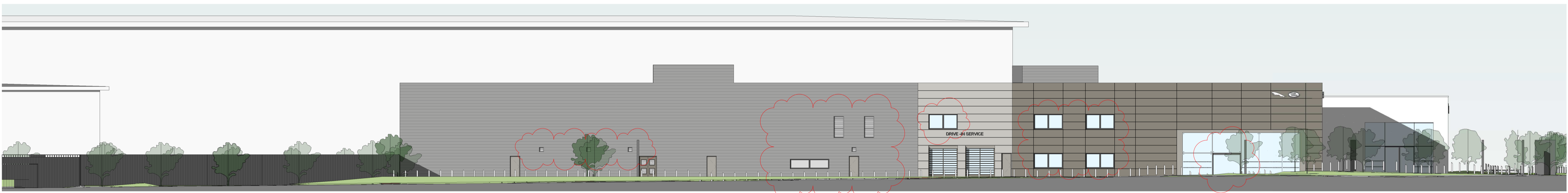
2 Proposed Site Elevation 2 1 : 200