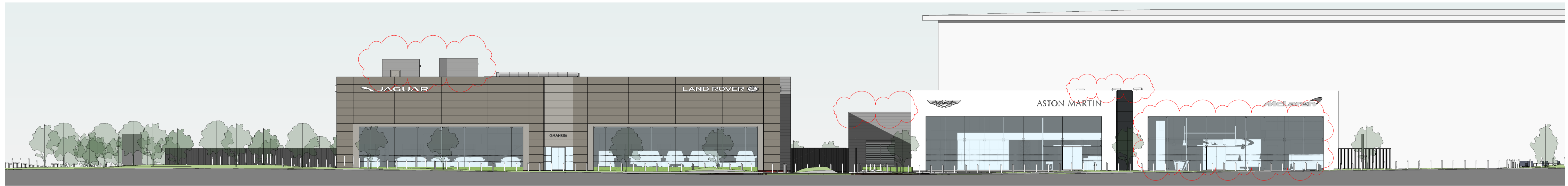
1 Proposed Site Elevation 1 1 : 200