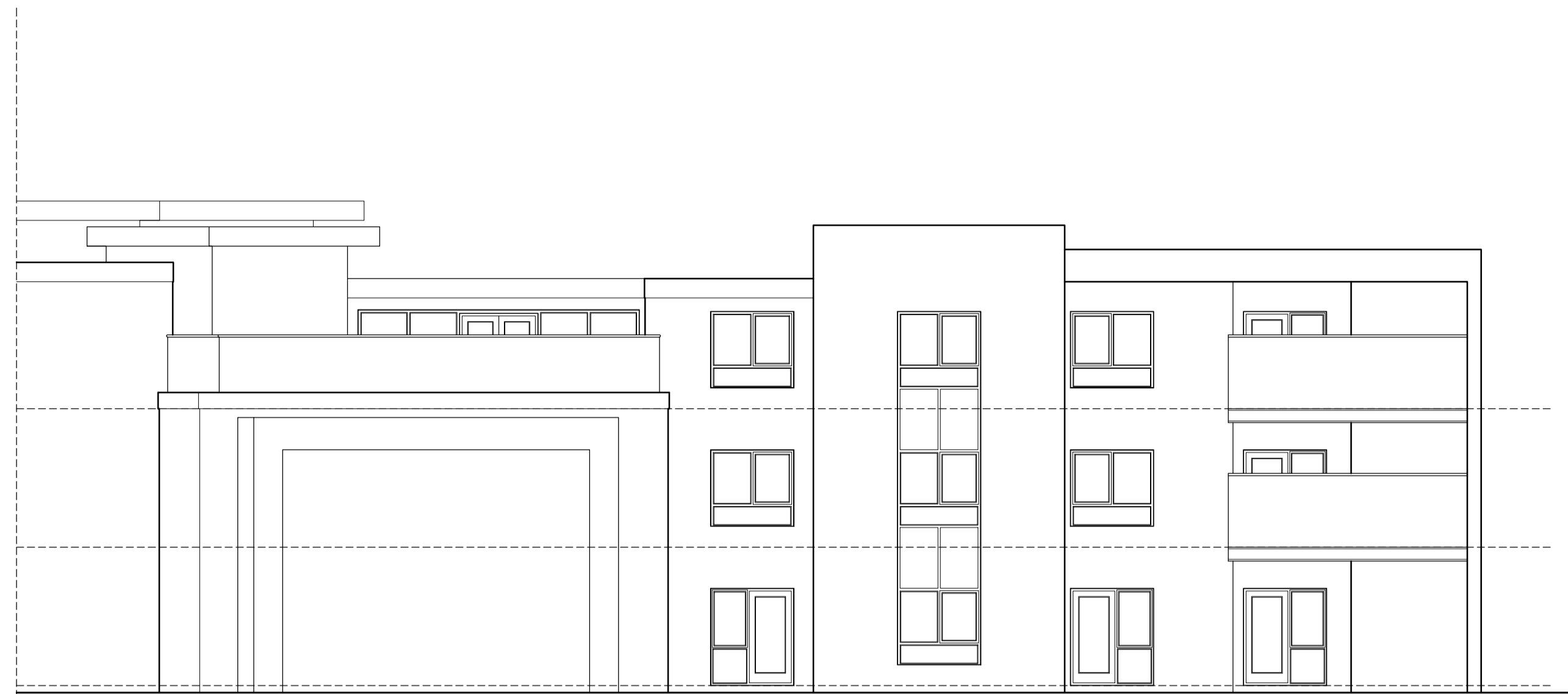
Proposed Elevation E