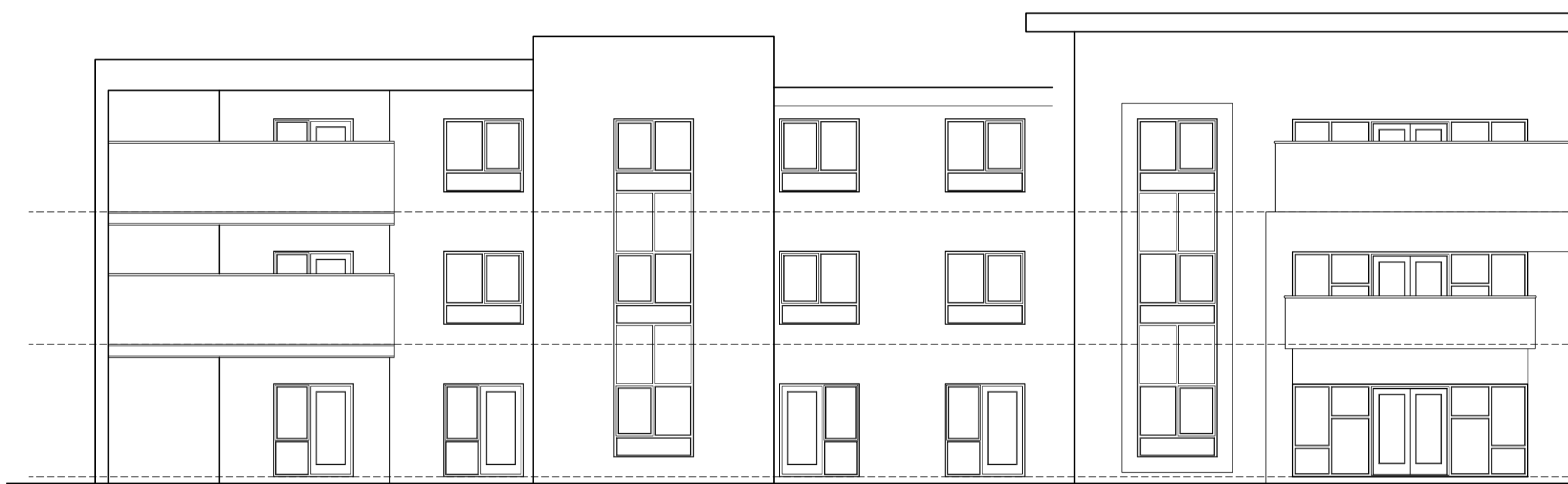
Proposed Elevation G