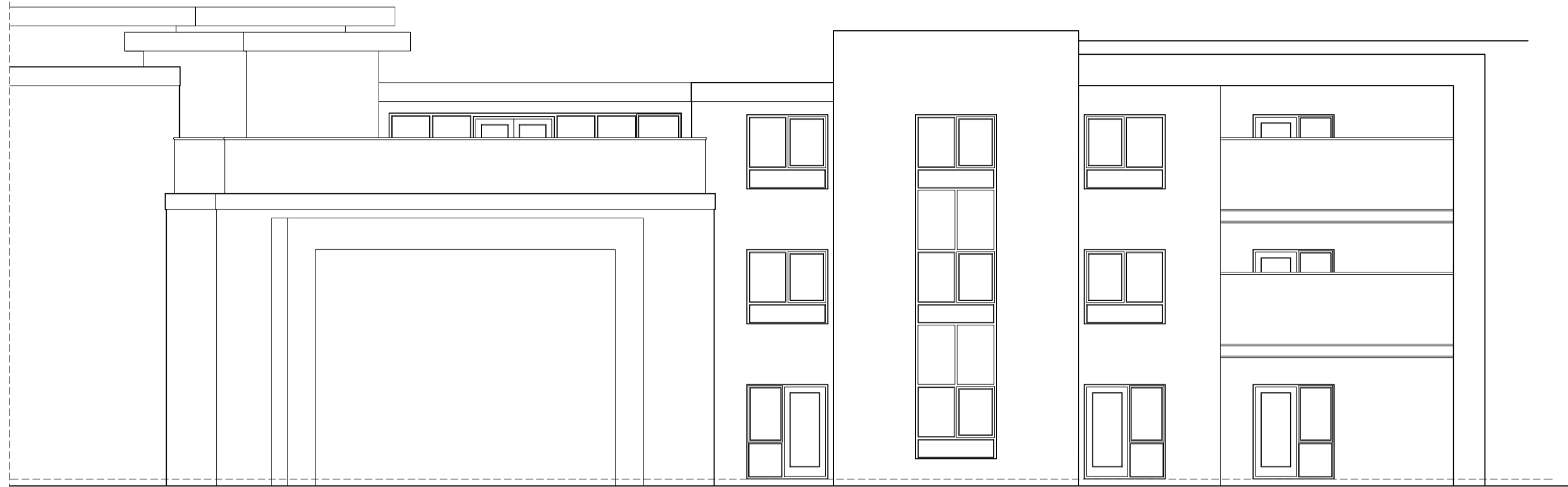
Proposed Elevation E