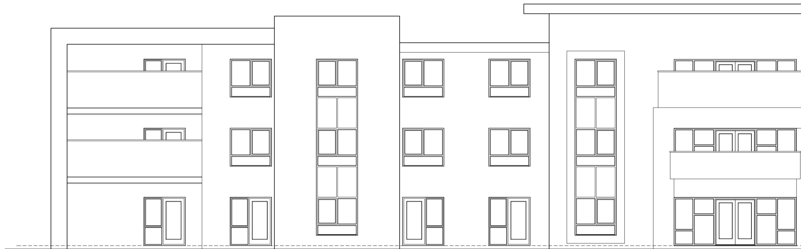
Proposed Elevation G