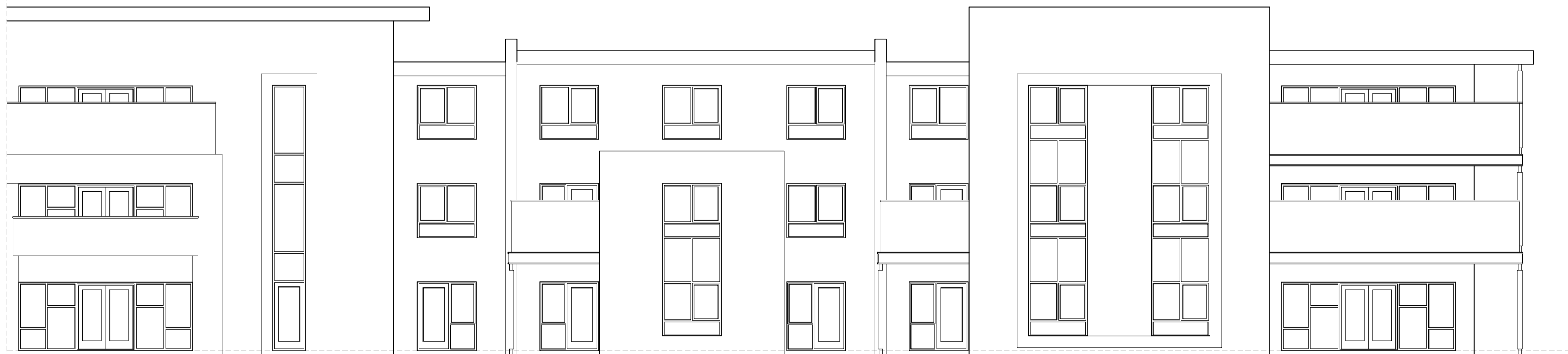
Proposed Elevation H